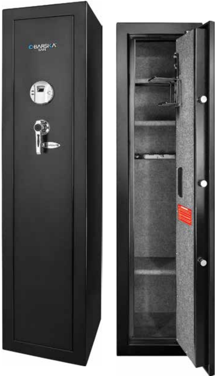
5.52 Cubic Ft Tall Biometric Rifle Safe AX11898