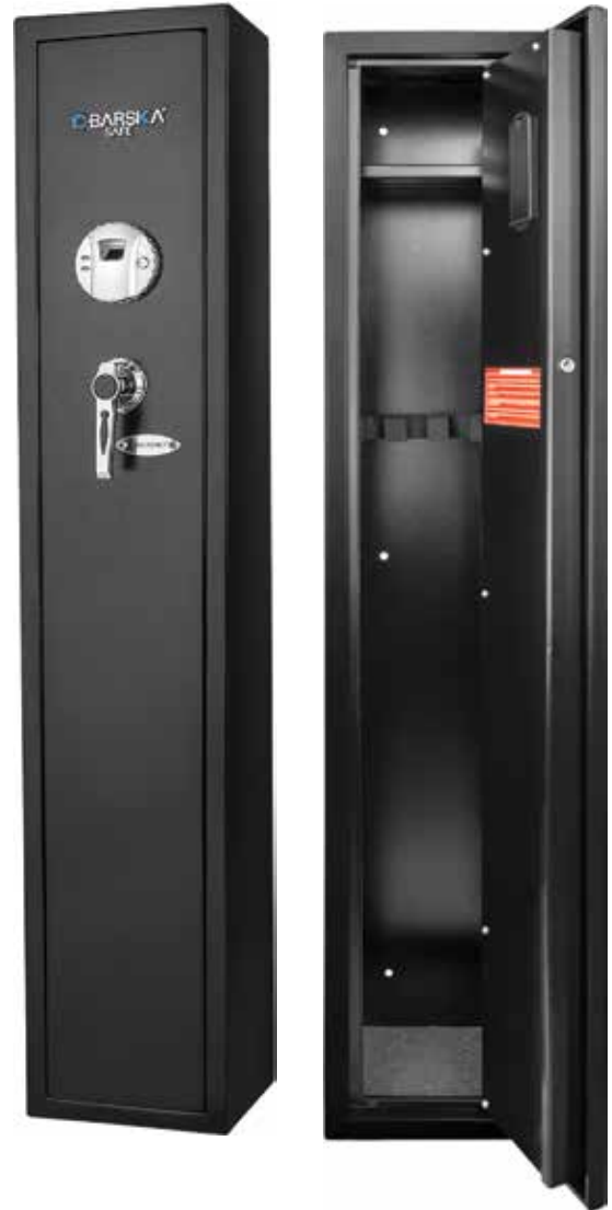
1.83 Cubic Ft Tall Biometric Rifle Safe AX11652