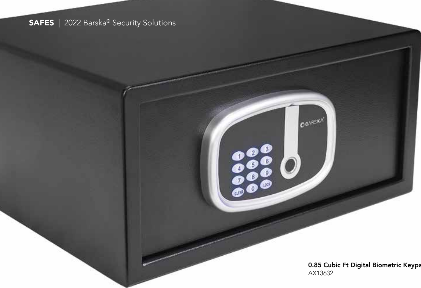
0.85 Cubic Ft Digital Biometric Keypad Safe AX13632