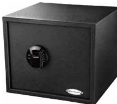
1.45 Cubic Ft Biometric Keypad Security Safe AX12428