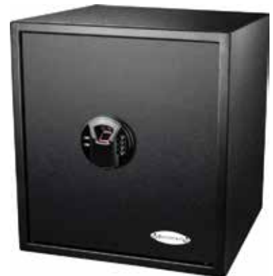
1.94 Cubic Ft Biometric Keypad Safe AX12842