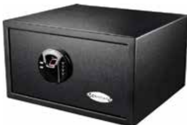
0.99 Cubic Ft Biometric Keypad Safe AX12840