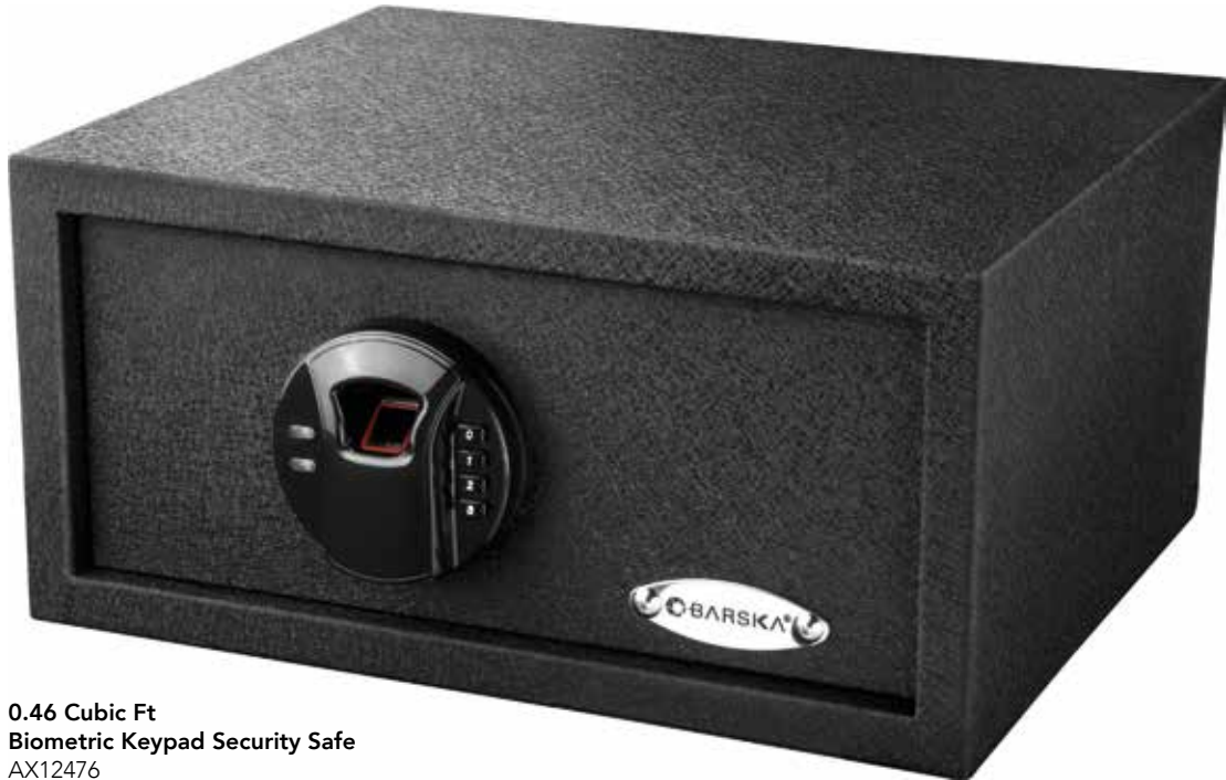
0.46 Cubic Ft Biometric Keypad Security Safe AX12476