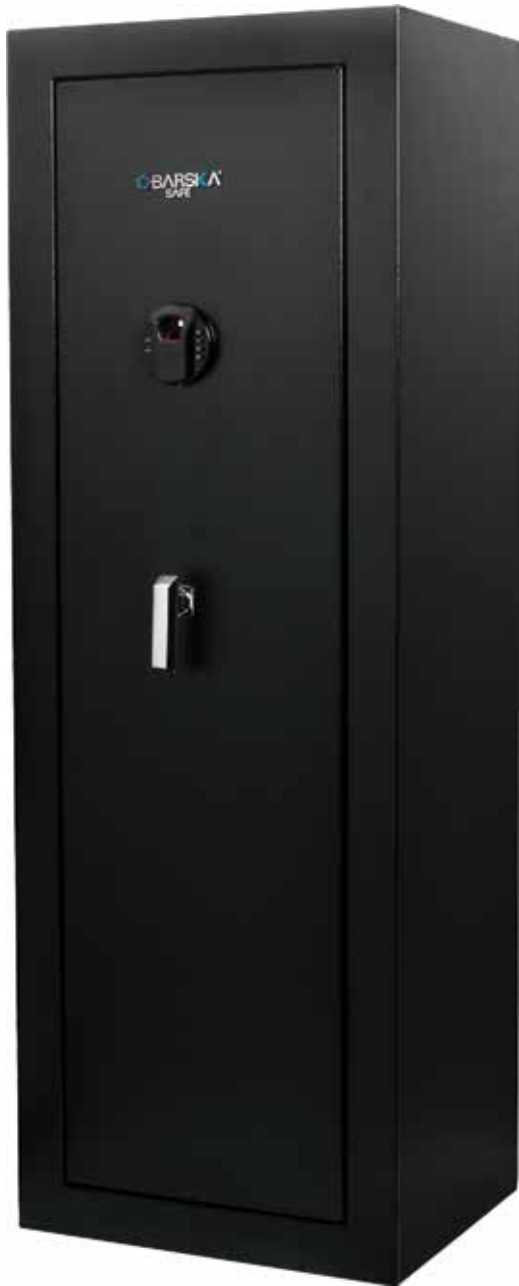
9.33 Cubic Ft Biometric Tall Keypad Rifle Safe AX13378