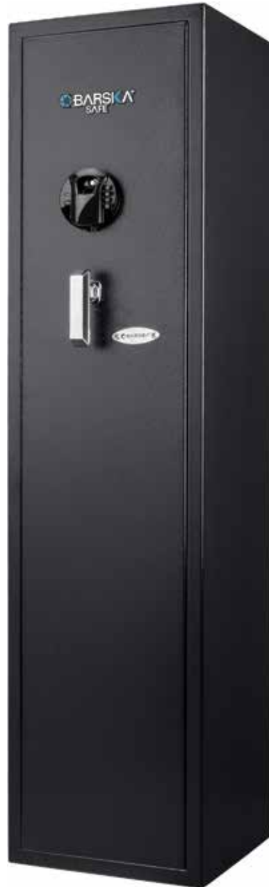
4.33 Cubic Ft Biometric Keypad Rifle Safe AX12752