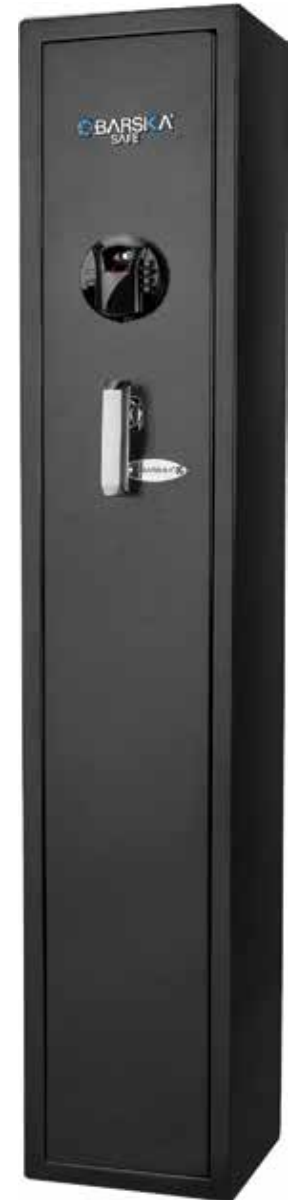
1.83 Cubic Ft Biometric Keypad Rifle Safe AX12760