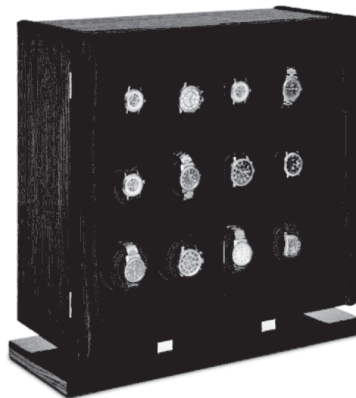
ROTORWIND AVANTI 12/16