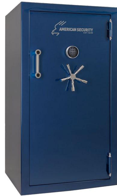
BFX6030 shown with optional finials

Dimensions listed are exterior dimensions. Add 3" on all BF® safes to overall depth for lock and handle.