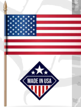
Made in the USA