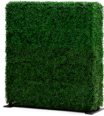
LOW PROFILE PLATFORM BASE