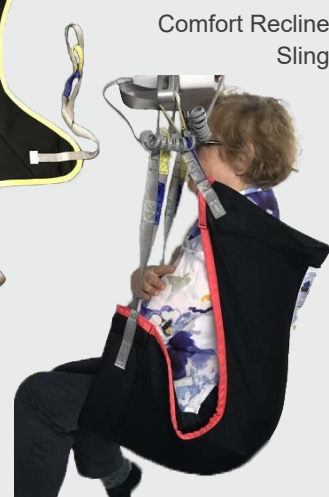
Comfort Recline Sling