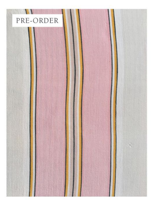
RECOVERED PANELS REC-RA-ROSA-013B Pre-Order