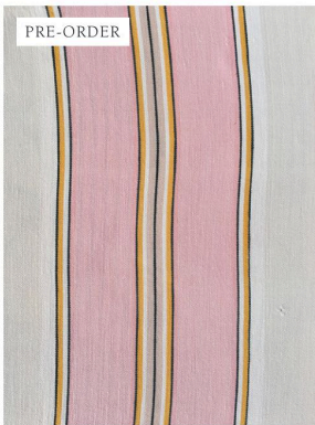
RECOVERED PANELS REC-RA-ROSA-013B Pre-Order

If you see a textile that is just the ideal you were looking for, but it is out of stock, we invite you to sign up for the waitlist. With any luck we will find it again and you will be the first to know. Simply join the waitlist for the fabric or message us so we can let you know the exact details as soon as panels become available.