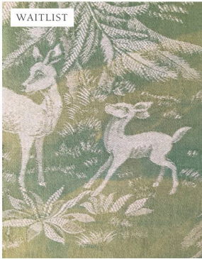
RECOVERED PANELS REC-DA-VERDE-006 Sold Out / Join Waitlist