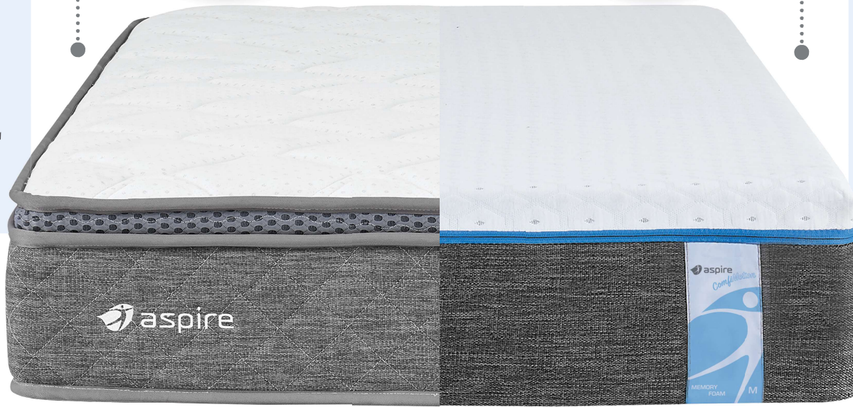
▲ Classic Pocket Spring Mattress