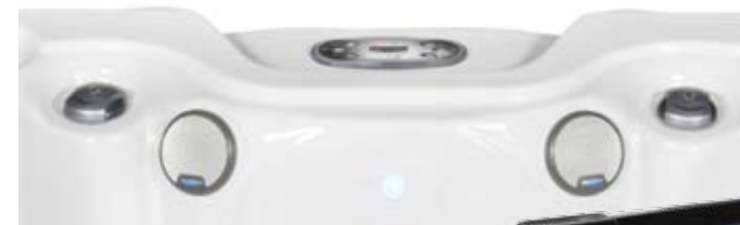
Bluetooth Music System