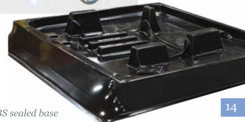
ABS sealed base