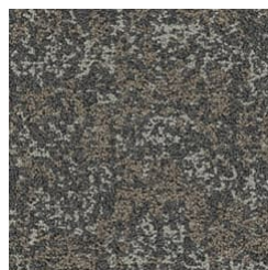
0829 GREAT HORNED