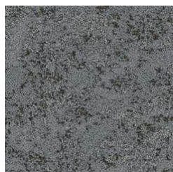
0938 EASTERN SCREECH