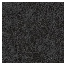
0969 GREAT GREY