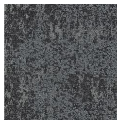
0949 WESTERN SCREECH