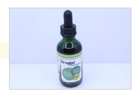
Unit: 2oz (57g) | Units Per Package:1

Analyzed via AAM-001 using Agilent 1220 HPLC-DAD. Limits are based on CO 6 CCR 1010-21. Sample was analyzed as received. Deviations from SOP: None.