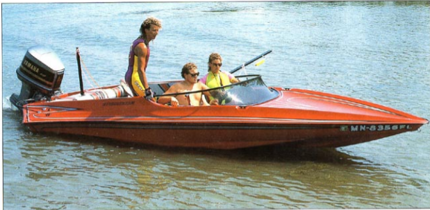
The "TRIDENT" stripe pattern - multicolor option.