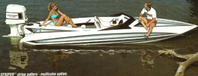
The 8-panel "STRIPER" stripe pattern - multicolor option.