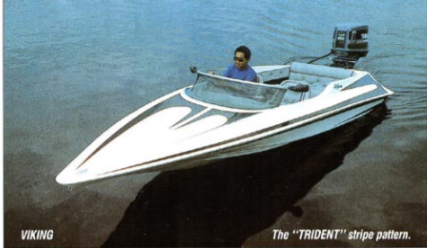
The "TRIDENT" stripe pattern.

The Viking and Valero differ only in exterior styling and interior room. The Viking offers the traditional HydroStream "look", while the Valero gains some rear seat room with a more conventional deck design. These two mid-sized sportboats are perfect for today's smaller V6 engines. If economy is a factor, opt for the V-bottom hull configuration and obtain strong performance from a V4 or in-line outboard. Either way, you'll be at the head of the pack! Both race and pleasure proven, they have stood the test of time and are available to delight performance enthusiasts everywhere.