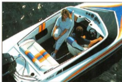
Multicolor Turbo graphics package.