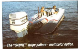
The "SABRE" stripe pattern - multicolor option.

NOTICE: The HST was originally designed for marathon racing conditions and has proven its ability to handle rough, choppy water. However, extreme caution should be used when operating this boat in large swells or cruiser wakes.