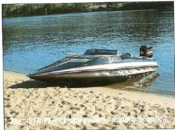
The "STRIPE" stripe pattern - multicolor option.