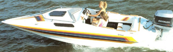
The "PANEL" stripe pattern - multicolor option.