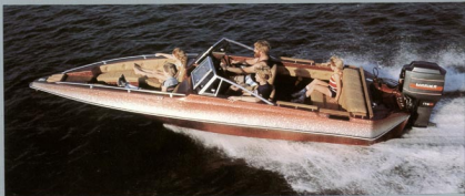
The "Autumn Mist" color scheme