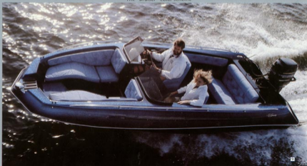
The "Bruiser" color scheme

*See Special Edition color scheme descriptions on page 11.