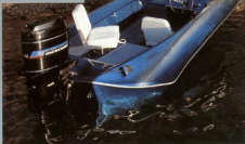
The "Elite" color scheme

*See Special Edition color scheme descriptions on page 11.