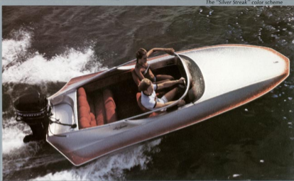
The "Silver Streak" color scheme

*See Special Edition color scheme descriptions on page 77.