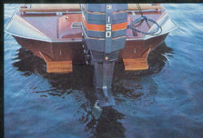
Teak Swim Steps