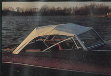
Venus High Windshield and Convertible Top