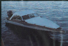
Voyager Convertible Top