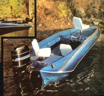
The "Elite" color scheme

*See Special Edition color scheme descriptions on page 11.