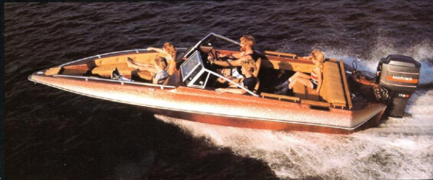
The "Autumn Mist" color scheme