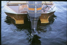
Teak Swim Steps