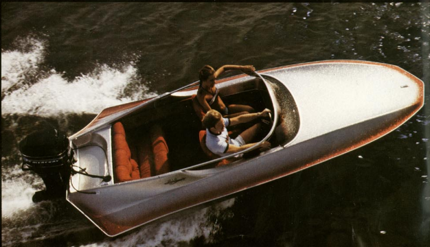
The "Silver Streak" color scheme