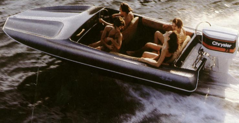
The "Moon Shadow" color scheme

*See Special Edition color scheme descriptions on page 7.