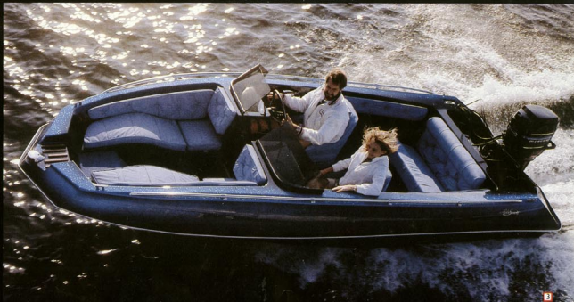
The "Bruiser" color scheme

*See Special Edition color scheme descriptions on page 7.