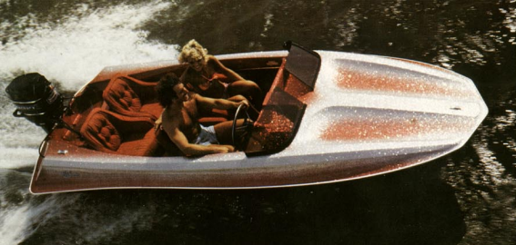
The "Daredevil" color scheme

*See Special Edition color scheme descriptions on page 7.