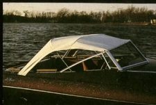
Venus High Windshield and Convertible Top