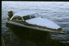
Voyager Convertible Top