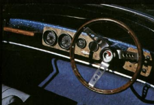
Deluxe Special Edition Dash Panel