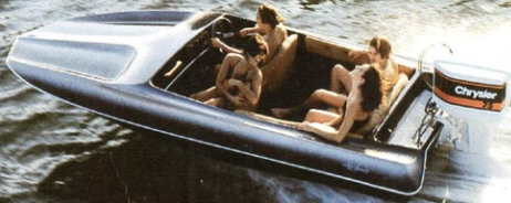
The "Moon Shadow" color scheme

*See Special Edition color scheme descriptions on page 7.