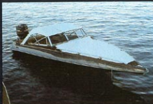
Voyager Convertible Top