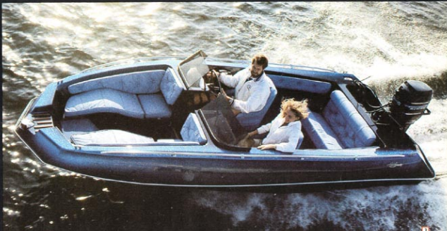
The "Bruiser" color scheme

*See Special Edition color scheme descriptions on page 7.