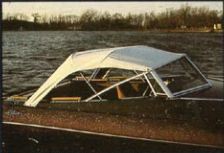
Venus High Windshield and Convertible Top