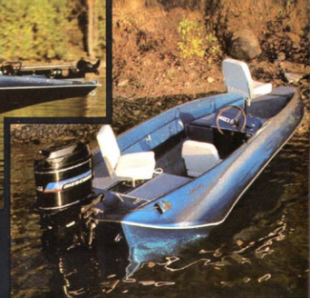
The "Elite" color scheme

*See Special Edition color scheme descriptions on page 7.