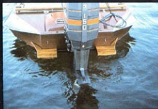
Teak Swim Steps