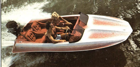
The "Daredevil" color scheme