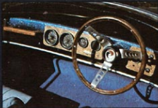
Deluxe Special Edition Dash Panel