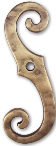
Antique Brass 05