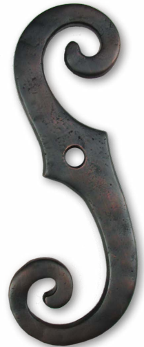
Oil-Rubbed Bronze 10B