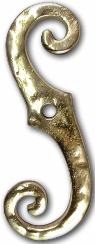
Polished Brass 03