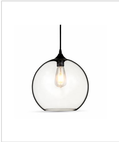
VT-7302 GLOBE GLASS PENDANT LIGHT -TRANSPARENT D:300