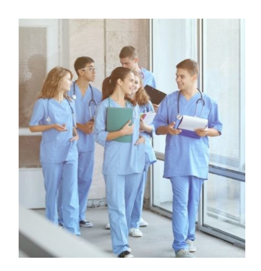
Ensures safety & Performance.