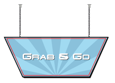
Station Signs $300 Width 48 x Height 18" x Thickness 1/2"