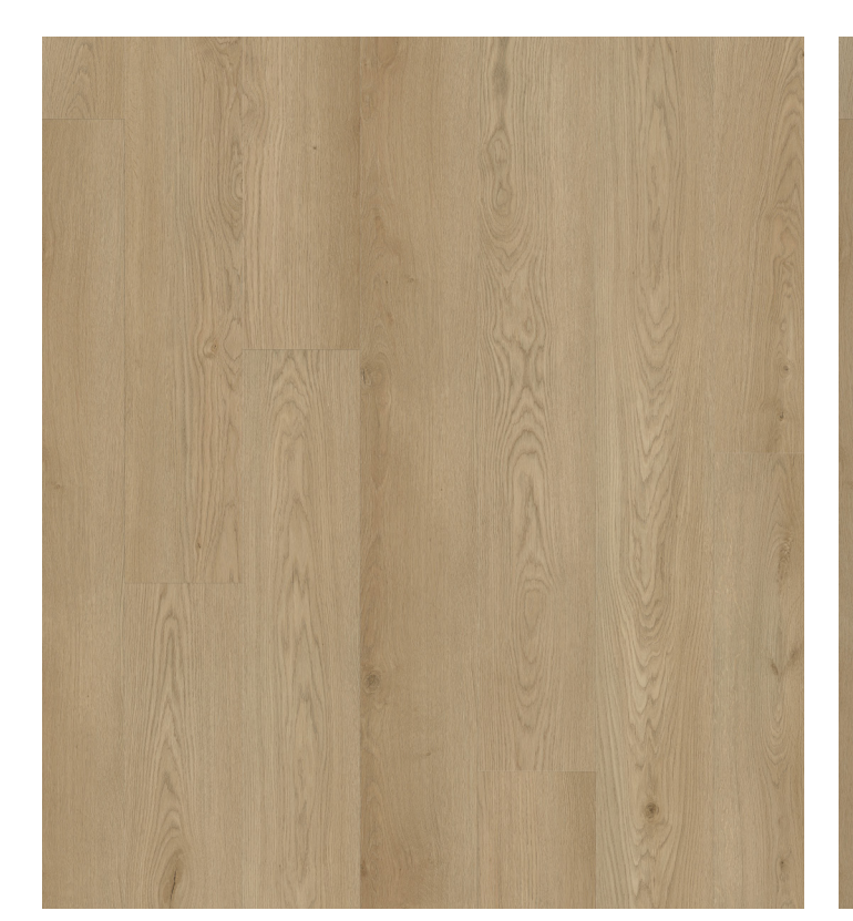
Pils Oak | 135