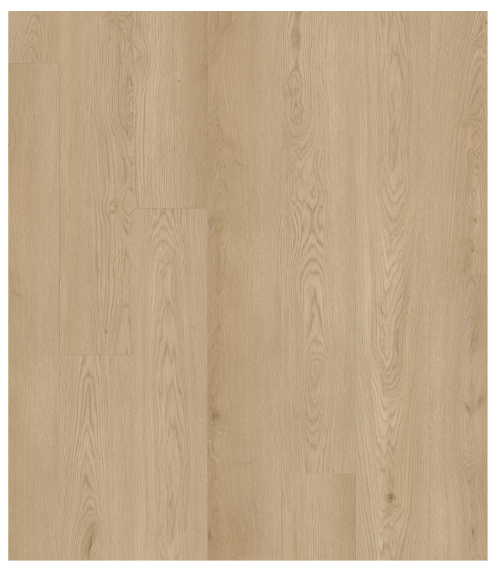
Jamieson Oak | 130