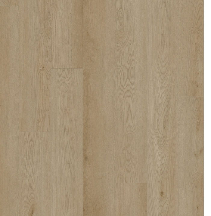
Booker Oak | 140