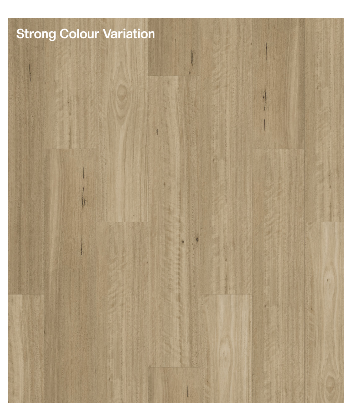
Jamieson Oak | 130