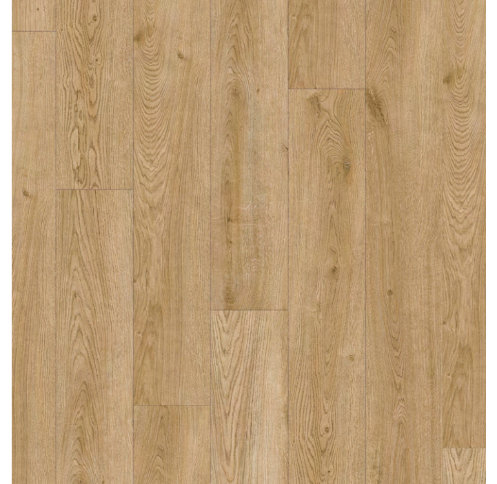
Classic Oak | 150