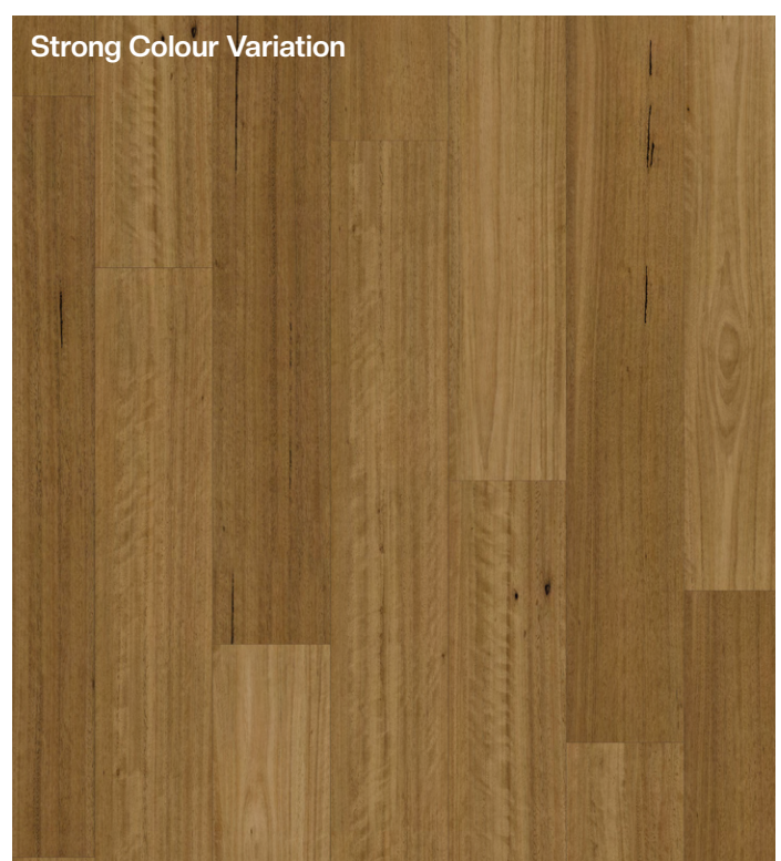
Sanded Blackbutt | 220