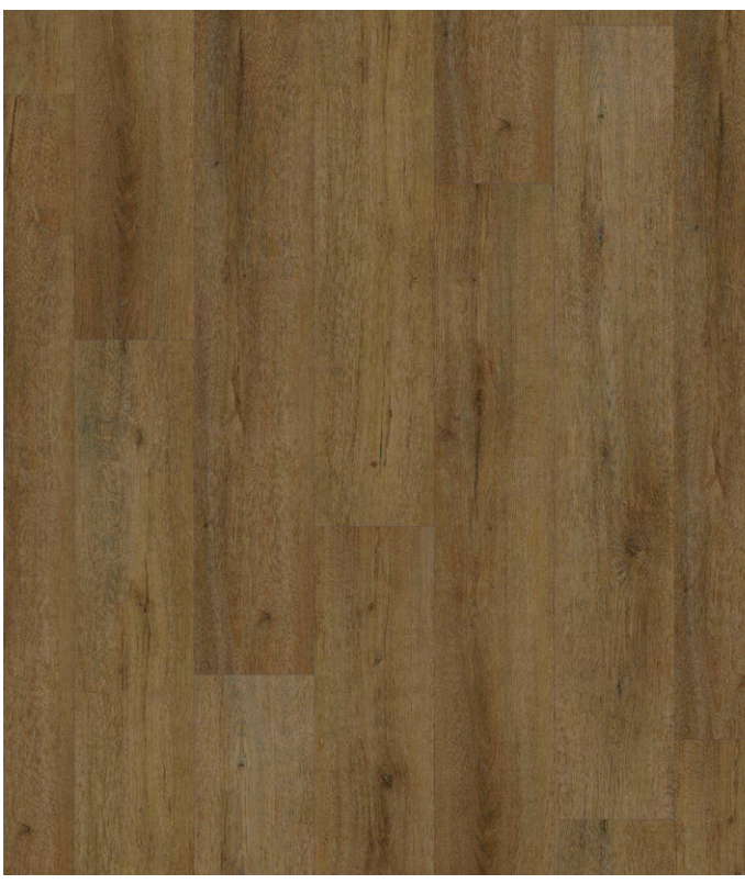
Havana Oak | 175