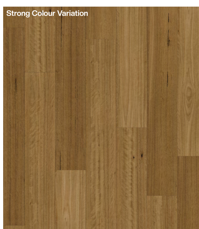
Grand Blackbutt | 250