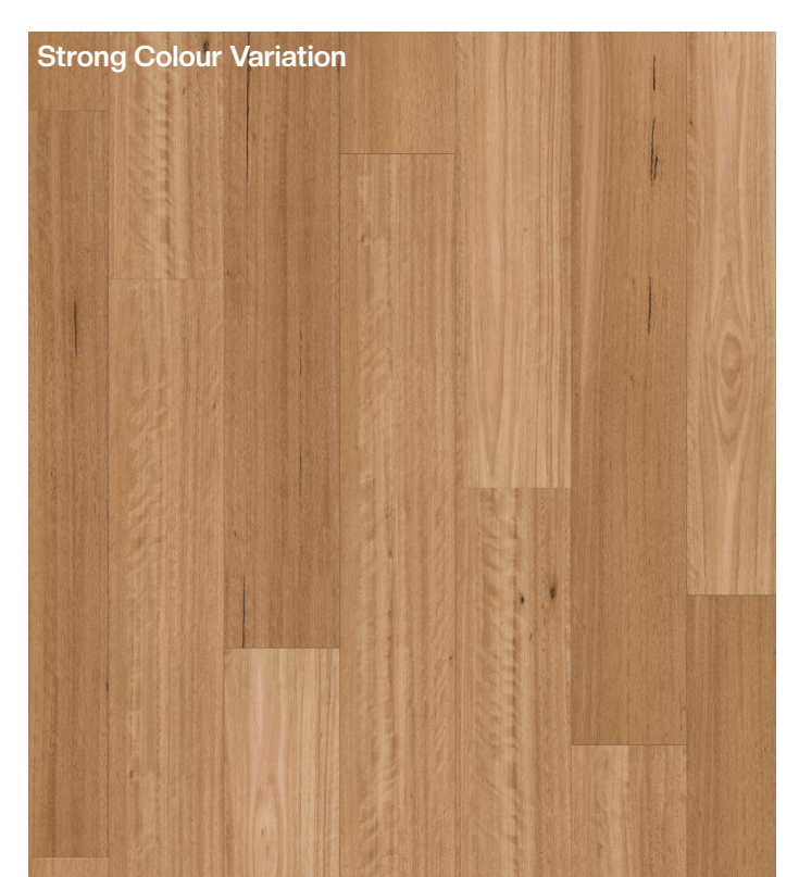
Silky Blackbutt | 220