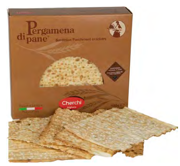
Cherchi Pane Carasau Sardinian Crackers Made with only 3 ingredients 4102ACA - 100g/3.5oz - 20/cs