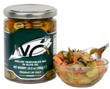
Antica Valle d'Ofanto Mixed Grilled Vegetable Blend in Olive Oil 20002VALLE - 290g/10oz - 12/cs