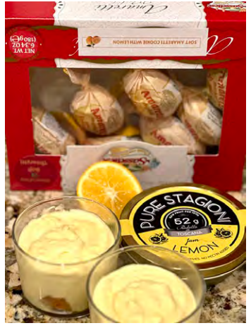
Try our La Sassellese lemon amaretti in a tiramisu with Pure Stagioni lemon jam or a tiramisu with La Sassellese hazelnut amaretti and Stramondo Chocolate Gianduia spread.