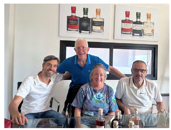
Our VR Aceti team has introduced and amazing Mediterranean Herb Balsamic this year, inspired by the herbal cuisine of the mountains of Italy and France.