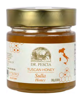
Dr. Pescia Honey Sulla 9014HON - 265g/9.34oz - 12/cs