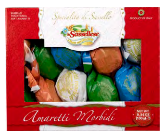
Soft Amaretti 27001SAS