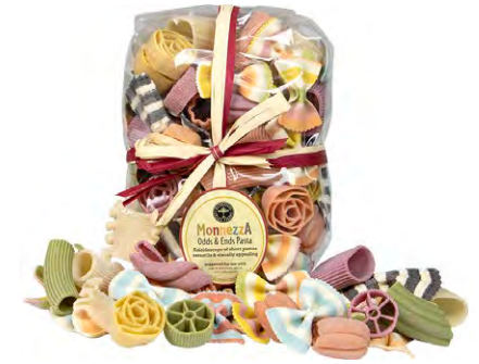
Marella Monezza Odds and Ends, Multi Color 22002MARELLA - 400g/14.1oz - 12/cs