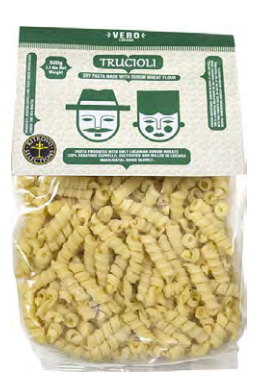
L' Ultimo Forno Trucioli 3101ULTI 500g/17.6oz - 12/cs Limited Availability