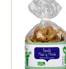
L'Ultimo Forno Mediterranean Taralli Taralli Mari & Monti 2131ULTI - 250g/8.8oz - 12/cs