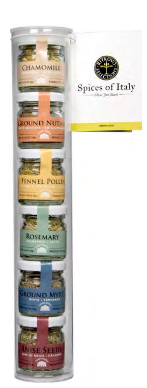
Casina Rossa Spices of Italy 88999CAS - 57g/2oz - 12/cs