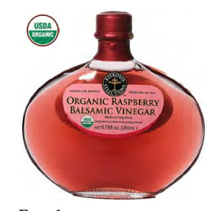
Raspberry 1507BALS - 200ml/6.8oz - 6/cs 1805BALS - 5L/1.3gal - each