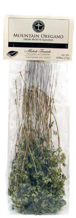
Michele Ferrante Dried Mountain Oregano in Branches 10008FER - 25g/0.88oz - 10/cs