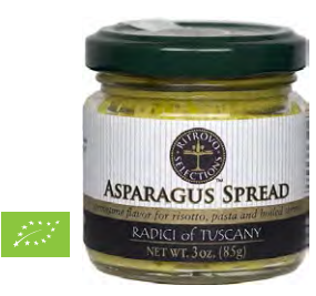
Radici of Tuscany Asparagus Spread 3009RAD - 85g/3.0oz - 16/cs