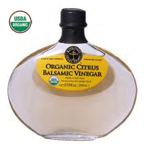
Citrus 1506BALS - 200ml/6.8oz - 6/cs 1804BALS - 5L/1.3gal - each