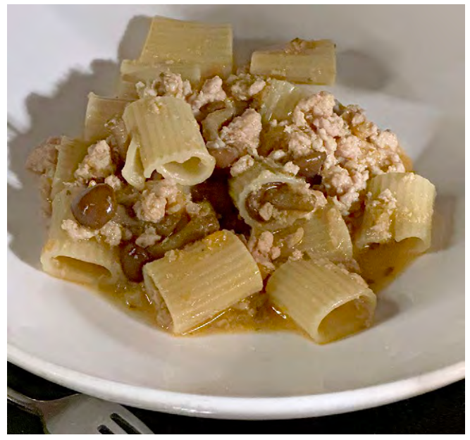
Typical Ligurian pasta dish of Paccheri pasta with rabbit white ragu and pitted taggiasca olives.