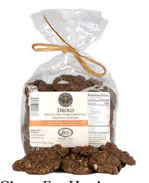
Gluten-Free Hazelnut Cookies Drolo 16009PRI - 334g/11.8oz - 12/cs sofi™ Silver Award: Outstanding Cookie