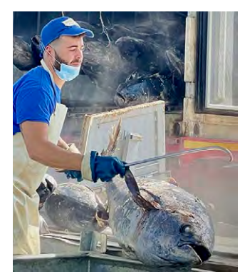
Tuna arrive whole and flash frozen. Part of the prestige of Callipo is they break the whole fish down expertly, by hand.

Tasters misjudge this balsamic as being a 10, 12, or even a 15-year Balsamic. That isn't just because it is made from carefully chosen basic ingredients, without additives of any kind, but also because of the closely guarded techniques which govern its aging. The balsamic also undergoes an accelerated yet regulated evaporation in former wine barrels of French Allier oak, resulting in a density and depth of flavor, intense aromaticity, and a clean delicateness of finish that belies its age and price. As one of our surprised Italian customers exclaimed, "... but it drinks like a 10-year!"