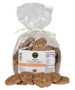
Gluten-free Almond Cookies Volo 1601PRI - 334g/11.8oz - 12/cs