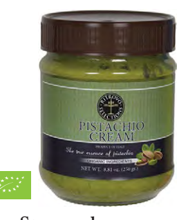
Stramondo Organic Sicilian Pistachio Cream 3101STRAM - 250g/8.8oz - 12/cs

68% Dark Raw Cacao Bar with Raspberries 20203CRU