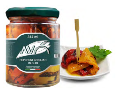
Antica Valle d'Ofanto Grilled Red and Yellow Peppers in Olive Oil 20011VALLE - 290g/10oz. - 12/cs