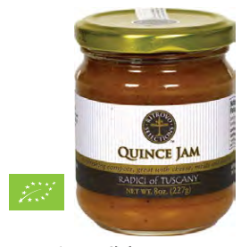
Radici of Tuscany Organic Quince Jam 3036RAD - 227g/8.0oz - 12/cs