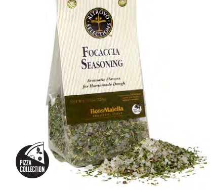
Fior di Maiella Focaccia Seasoning 8123FIOR - 100g/3.52oz - 12/cs