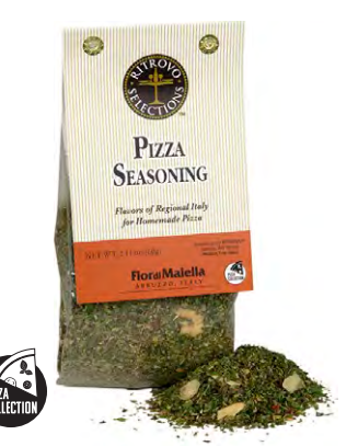
Fior di Maiella Italian Pizza Seasoning *SALT FREE 8121FIOR - 75g/2.64oz -12/cs