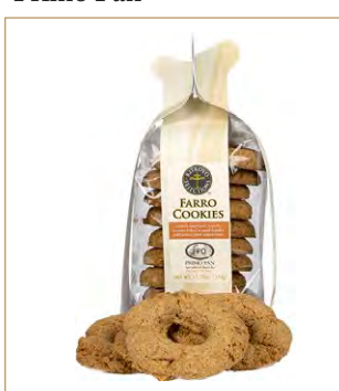
NEW! Farro Cookies Farinele 16004PRI - 334g/11.79oz - 12/cs