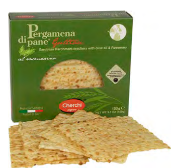
Cherchi Pane Carasau Sardinian Crackers with Olive Oil and Rosemary 4103ACA - 100g/3.5oz - 20/cs