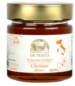
Dr. Pescia Honey Chestnut 9016HON - 265g/9.34oz - 12/cs