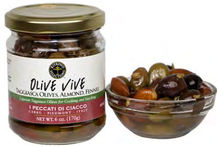
Ciacco Olive Vive with Almonds 6004CAJ - 170g/6oz - 6/cs