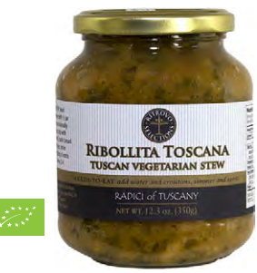
Radici of Tuscany Tuscan Vegetarian Stew Ribollita Toscana 3035RAD - 350g/12.3oz - 12/cs