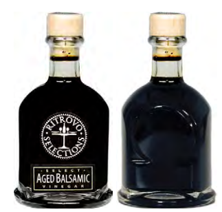
Maletti Aged Balsamic, Rossini Bottle 23007MAL - 250ml/8.5oz - 6/cs