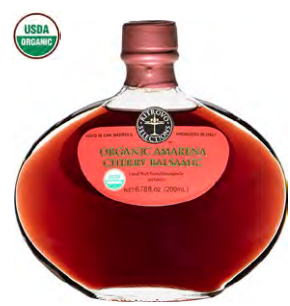
Amarena Cherry 1511BALS - 200ml/6.8oz - 6/cs