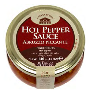
Casina Rossa Hot Pepper Sauce Abruzzo Piccante 14501CAS - 140g/4.9oz - 12/cs