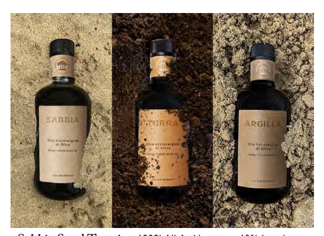
Sabbia Sand Terroir - 1008LAILA VARIETALS: 40% Leccino, 30% Frantoio, 20% Cucco, 10% Pendolino Terra Earth Terroir - 1007LAILA VARIETALS: 40% Intosso, 30% Dritta, 20% Tortiglione, 10% Cucco Argilla Clay Terroir - 1006LAILA VARIETALS: 30% Dritto, 30% Leccino del Corno, 30% Frantoio, 10% Tortiglione

Tenuta Sant'Ilario - 500ml/16.9oz - 6/cs