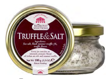
Casina Rossa Truffle & Salt

14035CAS - 100g/3.5oz - 12/cs 14900CAS - 1kg/2.2lb - each sofi™ Gold Award: Outstanding Condiment, Sauce, Salsa, Cooking Enhancer