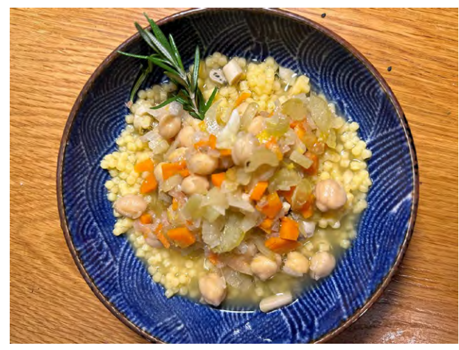
Chickpea and clam stew over Fior di Maiella Corn Couscous.