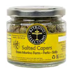
Marino Farms Wild-Harvested Salted Capers 11110MAR - 180g/6.4oz - 12/cs 11111MAR - 1 Kg/2.2 lbs - each