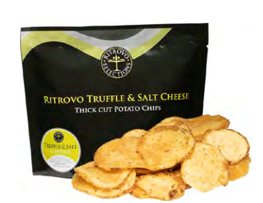
RITROVO SELECTIONS™ Truffle & Salt Cheese Thick Cut Potato Chips 2003RIT - 250g/8.8oz - 25/cs