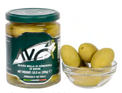
Antica Valle d'Ofanto Bella di Cerignola Large Olives in Brine 20003VALLE - 290g/10oz - 12/cs