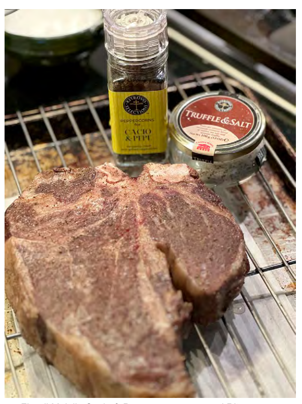
Fior di Maiella Cacio & Pepe peppercorns and Ritrovo Selections Truffle & Salt are the perfect seasoning on your favorite steak.