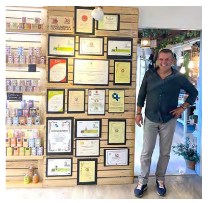
care for small markets throughout Europe. Like RITROVO® they value both tradition and innovation.

Stramondo has been making Sicilian confections for over 70 years. They are dedicated to using organic products from local sources, including locally-sourced pistachios and almonds. Stramondo submits their products to various organic certification committees which monitor the production and sourcing of their products. Their products have won awards in Great Britain's Organic Food Awards and in the US-based Fancy Food Show. In response to our customers' requests, RITROVO® is proud to be importing two of their most well-known products Pistachio Cream and Marzipan, under the RITROVO® label.