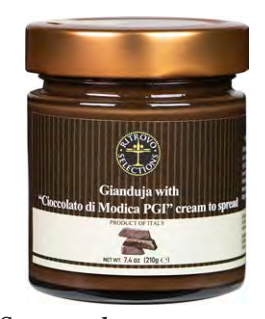
Stramondo Chocolate Hazelnut Spread with IGP Modica Chocolate Bits 3103STRAM - 255g/9oz -12/cs