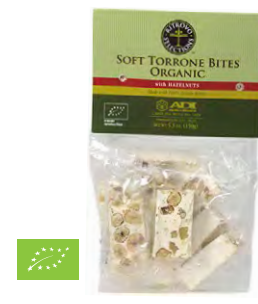
ADI Apicoltura Organic Soft Hazelnut Torroncini Bites 12200ADI - 150g/5.3oz - 12/cs