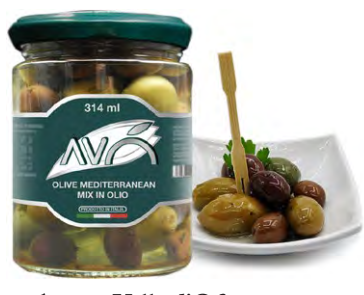
Antica Valle d'Ofanto Mediterranean Olive Mix in Olive Oil Cerignola, Nocellara, Leccino 20010VALLE - 290g/10oz. - 12/cs