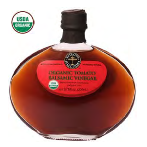
Tomato 1508BALS - 200ml/6.8oz - 6/cs