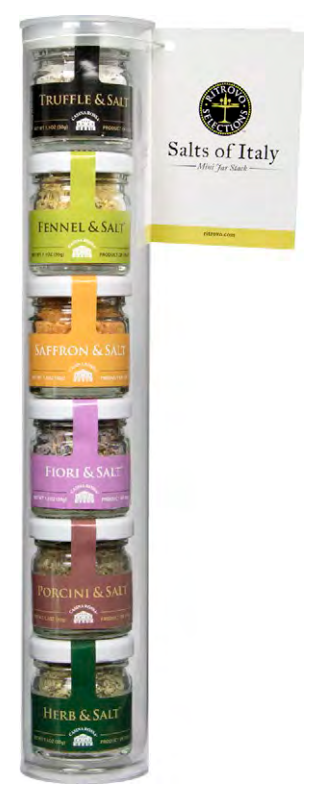
Casina Rossa Mini-Salt Stack 89001CAS - 180g/6.3oz - 12/cs