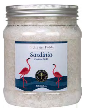
Coarse Sardinian Sea Salt Bulk Tub 87005SAR - 1kg/35.2oz - 2/cs