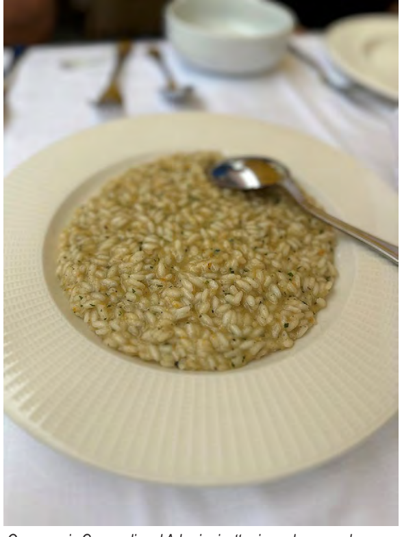
Our organic Carnaroli and Arborio risotto rices always make spectacular risottos.