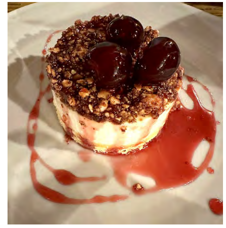
Use our Spiritosi cherries on desserts like cheesecake, flan and panna cotta.