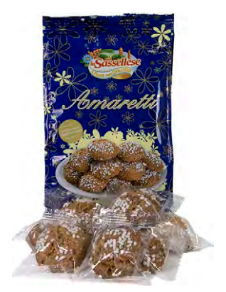
La Sassellese Crunchy Amaretti, flourless 27008SAS - 60g/2.1oz - 24/cs