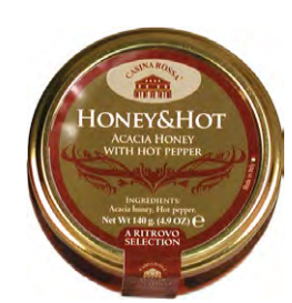
Casina Rossa Honey & Hot 14500CAS - 140g/4.9oz - 12/cs