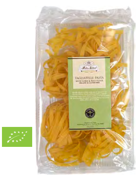
Pasta Natura Tagliatelle Pasta with Corn & Rice Flour Organic & Gluten Free 4107NAT - 250g/8oz - 5/cs