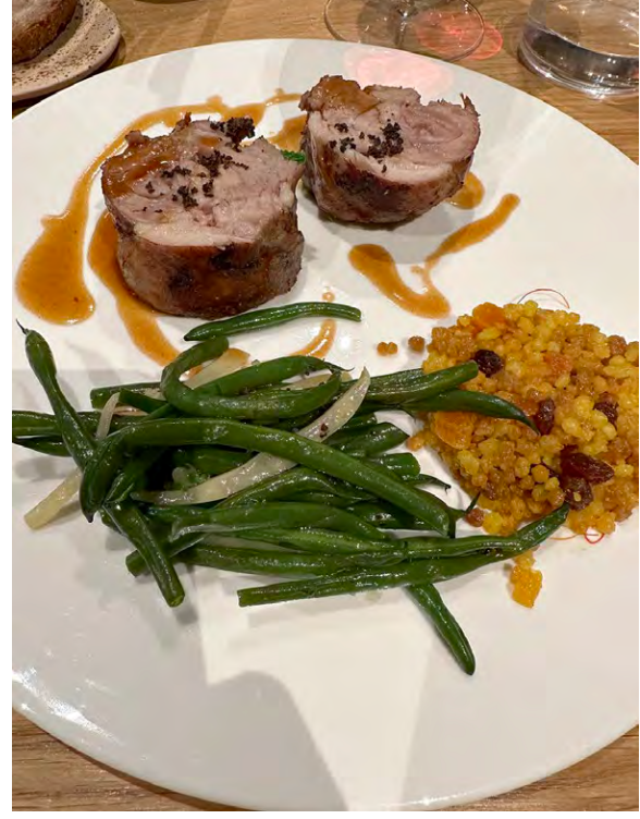
Our Organic toasted fregola makes for a great side dish always!