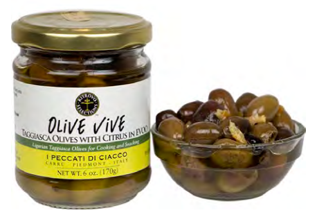
Ciacco Olive Vive with Citrus 6003CAJ - 170g/6oz - 6/cs