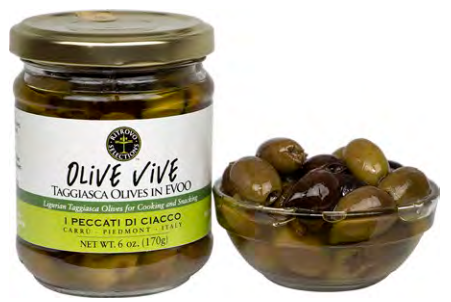
Ciacco Olive Vive 100%Taggiasca Olives 6002CAJ - 170g/6oz - 6/cs 11011BEL - 3 liter - 3/cs