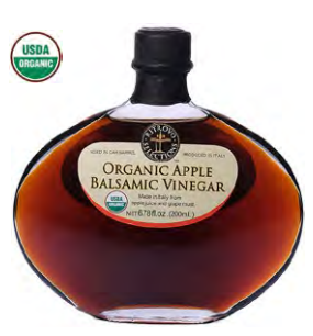
Apple 1505BALS - 200ml/6.8oz - 6/cs 1803BALS - 5L/1.3gal - each sofi™ Gold Award: Outstanding Vinegar