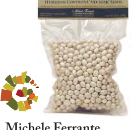
Michele Ferrante Campanian Heirloom "No Soak" Beans Fagioli di Controne 10001FER - 300g/10.6oz vacuum pack - 16/cs