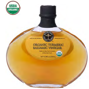
Turmeric 1509BALS - 200ml/6.8oz - 6/cs 1807BALS - 5L/1.3gal - each sofi™ Award: Outstanding New Product - Vinegar