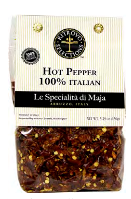
Fior di Maiella Hot Pepper Flakes 5105MAJA - 150g/5.3oz - 12/cs