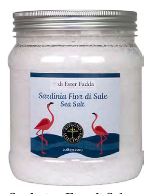
Sardinian Fior di Sale Sea Salt Bulk Tub 87004SAR - 1kg/35.2oz - 2/cs