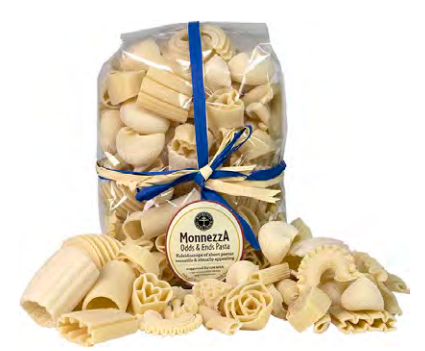
Marella Monezza Odds and Ends, Plain 22001MARELLA - 400g/14.1oz - 12/cs