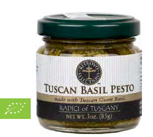
Radici of Tuscany Vegan Basil Pesto 3008RAD - 85g/3.0oz- 16/cs