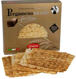
Cherchi Pane Carasau Sardinian Crackers with Italian Truffle 4104ACA - 100g/3.5oz - 20/cs