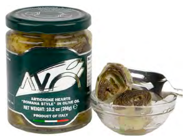
Antica Valle d'Ofanto Romana Style Artichokes in Olive Oil 20001VALLE - 283g/10oz - 12/cs 20006VALLE - 3 liter - each