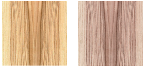
Natural olive ash Nude olive ash