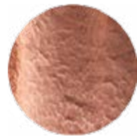
POLISHED HAMMERED COPPER