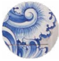
HAND PAINTED TILE BLUE