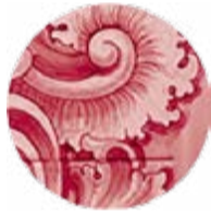
HAND PAINTED TILE BORDEAUX