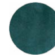
SIÈGE D.8120 COR 0785