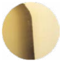
POLISHED BRASS W. GLOSS