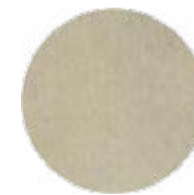
SIÈGE D.8120 COR 0076