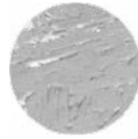
SILVER LEAF ON PARTICLE BOARD