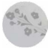
VENETIAN BEVELED MIRROR