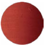
RAVISHING RED SILK