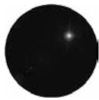
BLACK LACQUER W. GLOSS