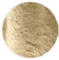
POLISHED HAMMERED BRASS