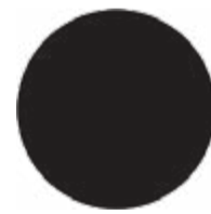
BLACK LACQUER W. MATE