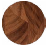
WALNUT GEOMETRIC MOSAIC