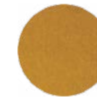
SIÈGE D.8120 COR 0166