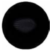
BEVELED BLACK GLASS