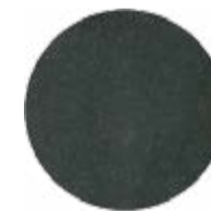
SIÈGE D.8120 COR 0859