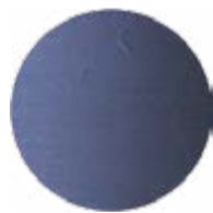
RAVISHING BLUE SILK