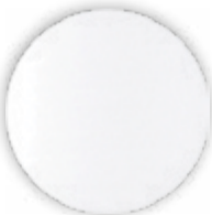
RAVISHING WHITE SILK