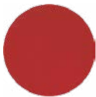
SIÈGE D.8120 COR 0166