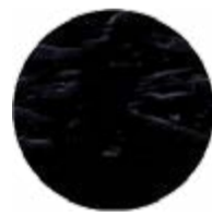
BLACK LACQUER ON PARTICLE BOARD