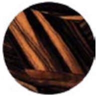
EBONY GEOMETRIC MOSAIC