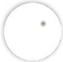
WHITE LACQUER W. GLOSS