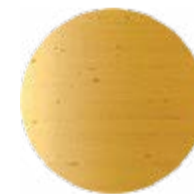
RAVISHING SUN SILK