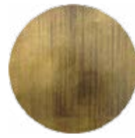
GOLD BRASS PATINA