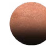
COPPER LEAF GRADIANT