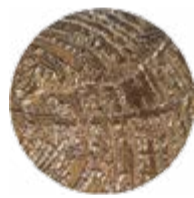
NEWTON TOP TEX- TURE