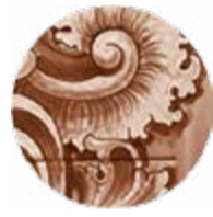
HAND PAINTED TILE SEPIA