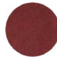
SIÈGE D.8120 COR 0371