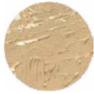
GOLD LEAF ON PARTICLE BOARD