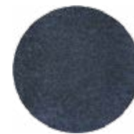
SIÈGE D.8120 COR 0549