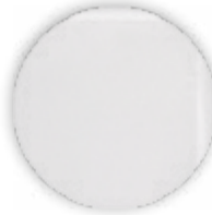
BEVELED WHITE GLASS