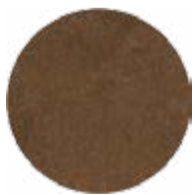
SIÈGE D.8120 COR 0452