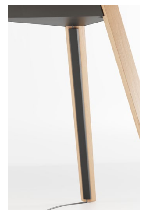
Wire holder. Wire holder made of steel sheet, powder coated in thermoreinforced polyester. Mounting on the leg by manual adjustment without the need for tools. The fastening screws are included and installed.