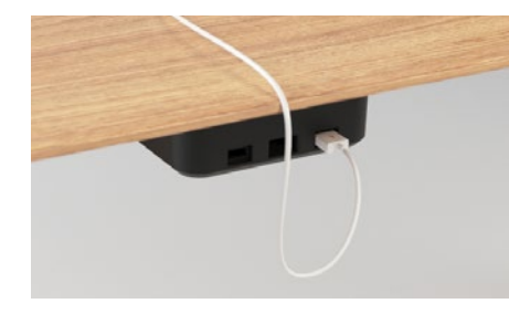
USB hub with battery. USB hub with two USB device charging ports without being plugged into electric current. It's needed to buy the battery charging tray to charge the USB hub battery.