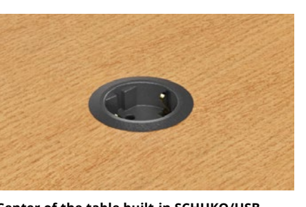
Center of the table built-in SCHUKO/USB powerbox. Built-in Schuko socket powerbox in the middle of the table for device charging.

USB port. Built-in USB hub for charging electronic devices, built in the center of the tabletop. The cable length is 1.0 m with USB connection. Available in black or white.