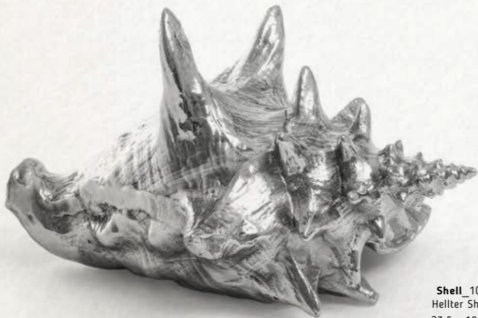
Shell_10894 Hellter Shellter cm. 23,5 x 19 h. 13,5 ≈ 9.2" x 7.5" h. 5.3" ≈

Collectible sculptures Design: Diesel living | Material: Aluminium