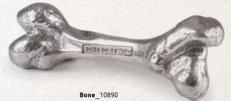
Bone_10890 Bone to be wild cm. 37 x 12,5 x 12,5 ≈ 14.6" x 4.9" h. 4.9" ≈