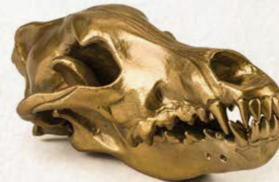
Wolf skull_10892 Wolf this way cm. 14 x 28 h. 12 ≈ 5.5" x 11" h. 4.7" ≈