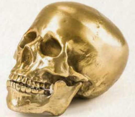
Human skull_10891 Culture Skulture cm. 13 x 20 h. 15 ≈ 5.1" x 7.9" h. 5.9" ≈