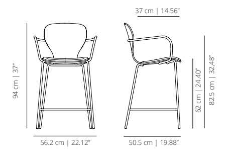
EATC4PROC + EA4BRM