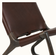
Mustang / Sirka Grey Stained

Rocker Chair combines the old saddle belt technique with traditional woodworking crafts in a timeless and characteristic design. The visible joint details, as well as the high-quality full-grain leather gives the rocking chair comfort and durability. The leathers are carefully selected from the harness range of vegetable-tanned hides by Sorensen Leather with no use of chrome or chemicals. Durable for both private and public use.