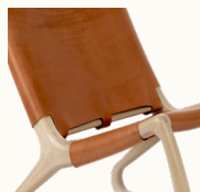
Whiskey / Matt Lacquered