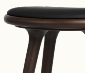
Dark Stained Beech

The Low Stool is designed by the Danish architect duo Space Copenhagen and is regarded as a New Danish Classic . With its organic yet minimalist style, this stool is suitable for both residential and commercial use. The Low Stool Collection is made from solid FSC® certified wood. Durable for both private and public use.