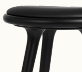
Black Stained Beech