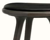
Grey Stained Beech