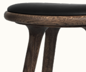
Dark Stained Oak