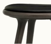
Grey Stained Beech