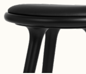
Black Stained Beech