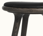
Sirka Grey Stained Oak