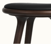
Dark Stained Beech

The High Stool is designed by the Danish architect duo Space Copenhagen and is regarded as a New Danish Classic . With its organic yet minimalist style, this stool is suitable for both residential and commercial use. The High Stool Collection is made from solid FSC® certified. Durable for both private and public use.