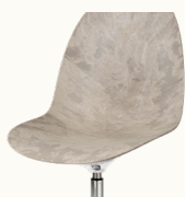
Wood Waste Grey

The Eternity Swivel chair is made with a soft-shaped shell of our waste material Matek®. The waste materials used for the Matek® come from post-consumer e-waste mixed with either wood or coffee waste, depending on the colour. The base frame is made of 96% recycled, polished aluminum and is mounted with castors for easy flexibility. The Eternity Swivel Chair is extraordinarily suitable as an office chair.