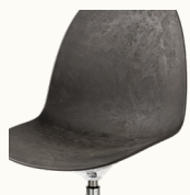
Coffee Waste Black