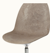
Coffee Waste Light