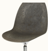
Coffee Waste Dark