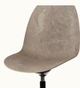
Coffee Waste Light