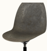
Coffee Waste Dark