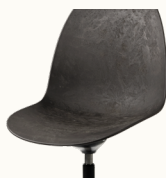
Coffee Waste Black