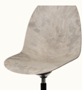
Wood Waste Grey

The Eternity Swivel chair is made with a soft-shaped shell of our waste material Matek®. The waste materials used for the Matek® come from post-consumer e-waste mixed with either wood or coffee waste, depending on the colour. The base frame is made of 96% recycled, black-painted aluminum and is mounted with castors for easy flexibility. The Eternity Swivel Chair is extraordinarily suitable as an office chair.