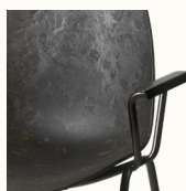
Coffee Waste Black