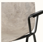
Wood Waste Grey

The Eternity Armchair is made with an organic-shaped shell of Matek®, made in a combination of post-consumer e-waste and either wood or coffee waste. The light armrest made of steel offers extra comfort to the sleek and sculptural chair. The chair is available in several Matek® blends and upholstery options. The Eternity Armchair is designed to easily integrate into various interior aesthetics and is durable for both private and public use.