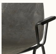
Coffee Waste Dark