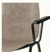
Coffee Waste Light