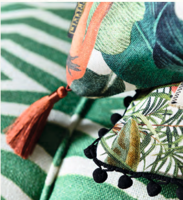
Details of tassels and pom-poms