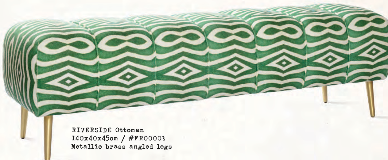
RIVERSIDE Ottoman 140x40x45cm / #FR00003 Metallic brass angled legs