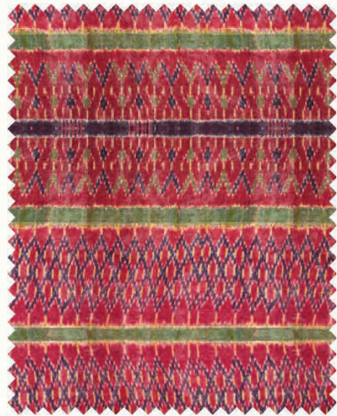
LAKAI Heavy linen / #FB00004