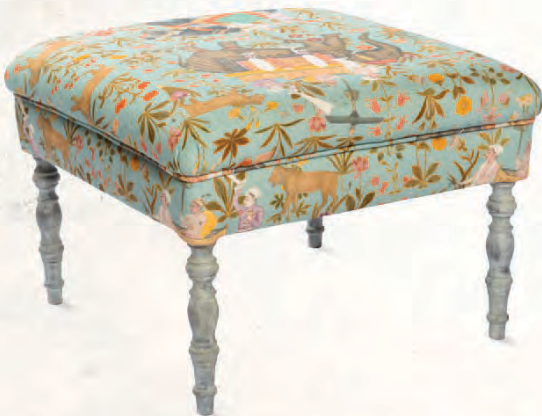
HINDUSTAN Aquamarine Ottoman 50x50x35cm / #FR00005 Vintage grey wooden legs