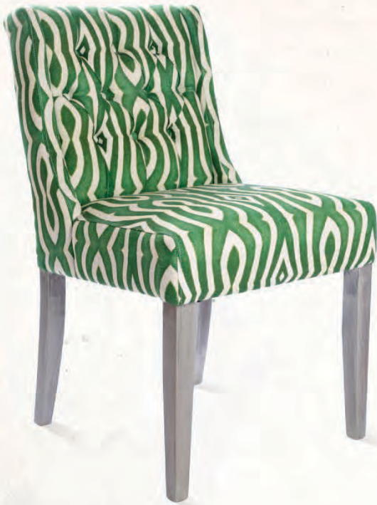
RIVERSIDE Tufted Chair 51x63x85cm / #FR00010 Vintage grey wooden legs