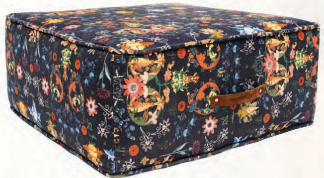
TRANSYLVANIA FOLK Floor Cushion 70x70x33cm / #FR000I3 Suede leather handle