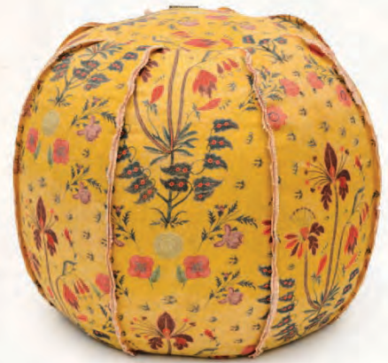
GYPSY Ochre Linen Pouf 60x60cm / #FR00011