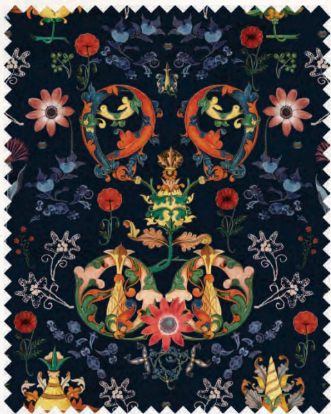
TRANSYLVANIA FOLK / #FB00012