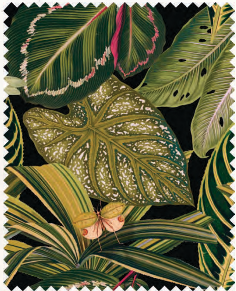
AMAZONIA / #FB00005