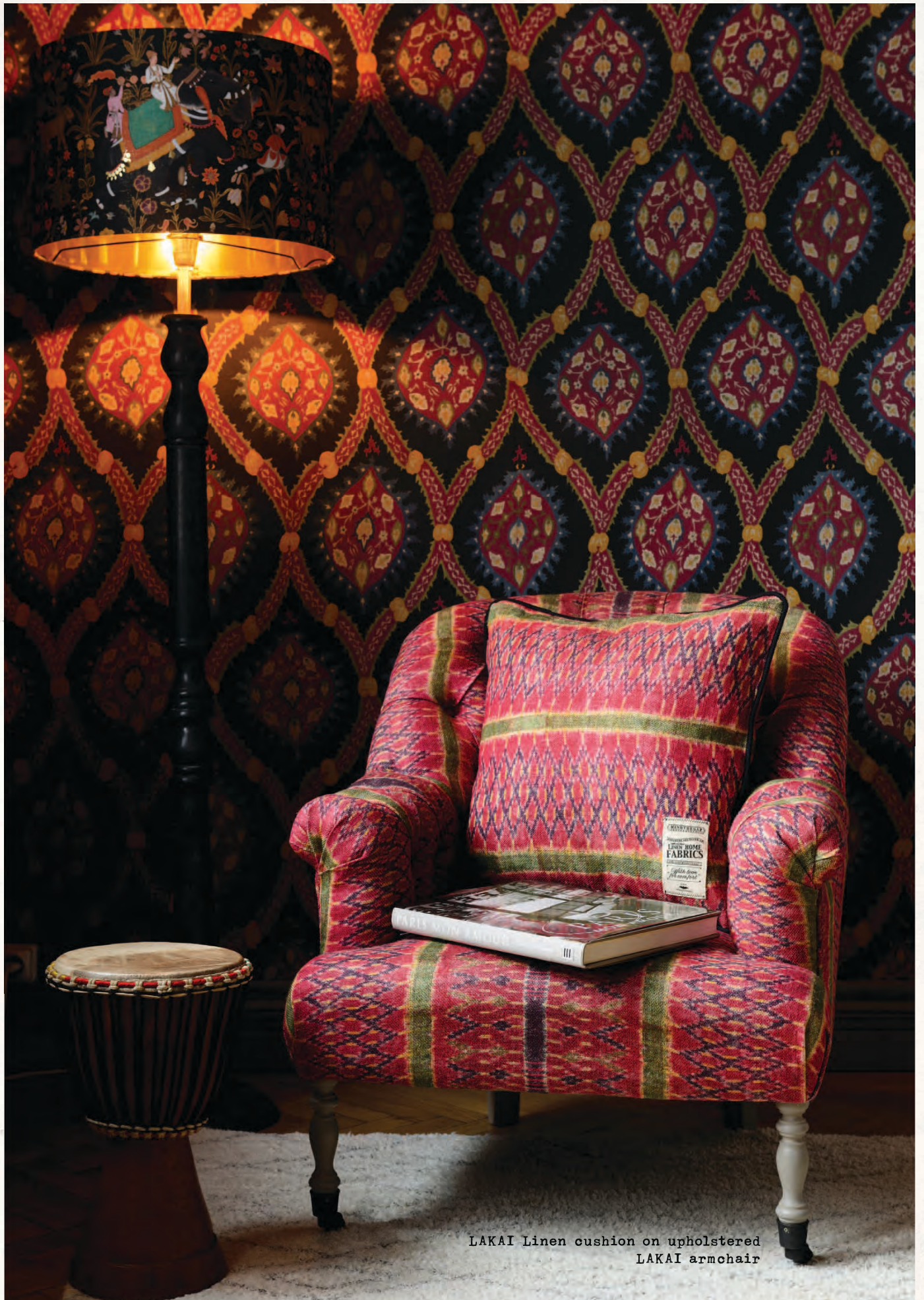
LAKAI Linen cushion on upholstered LAKAI armchair