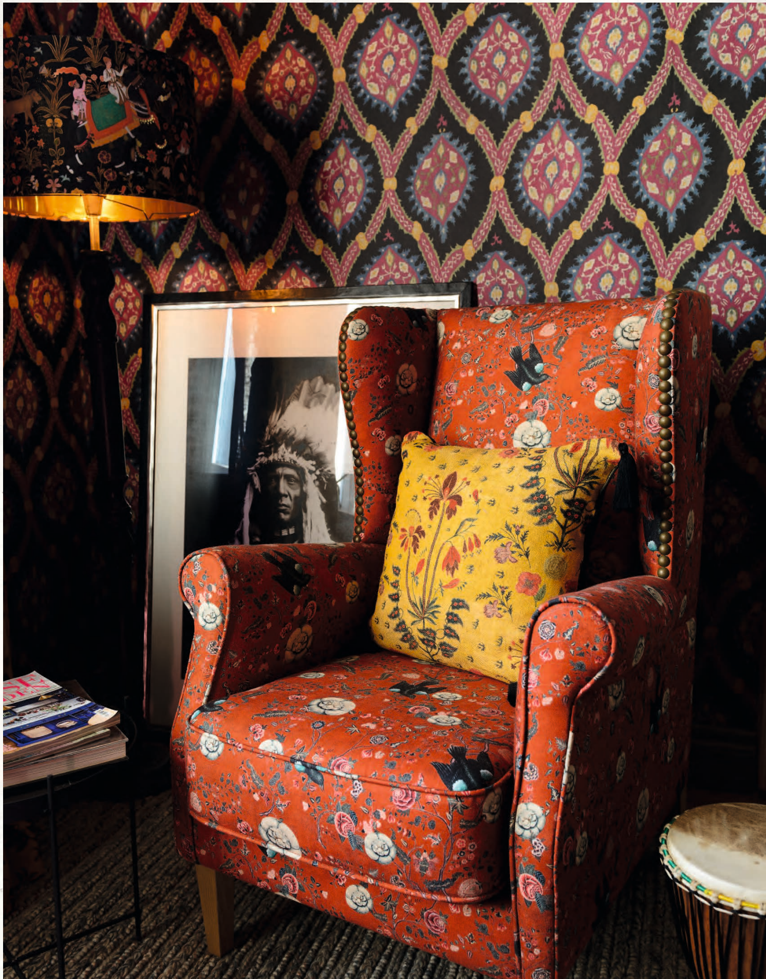
A statement armchair in BLACK BIRD linen fabric with a heavy linen GYPSY OCHRE cushion.