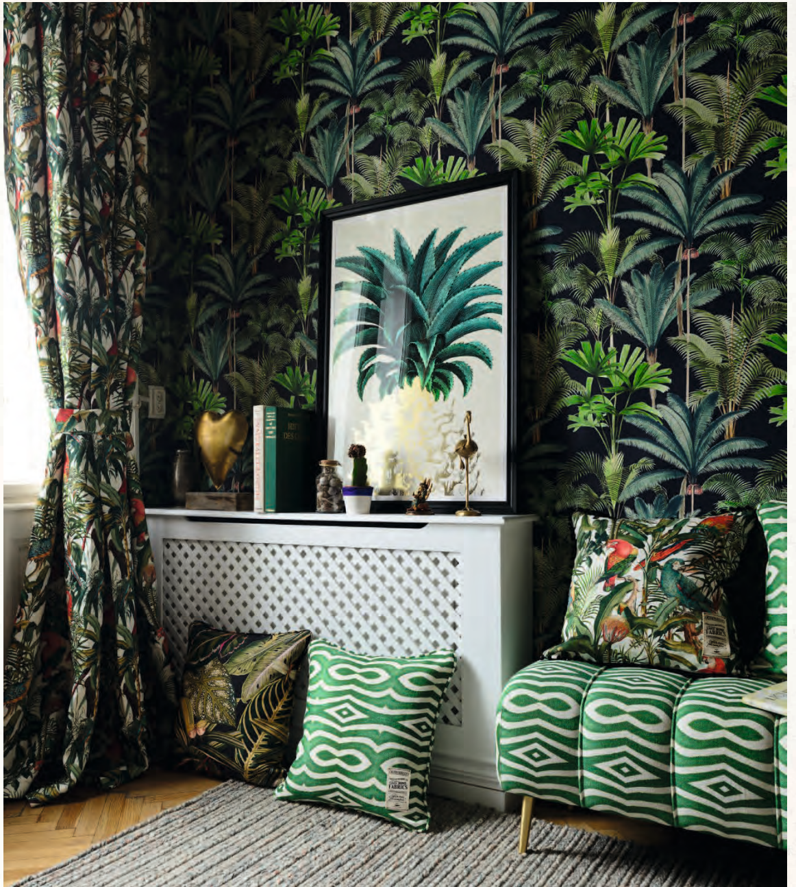
RIVERSIDE Ottoman with tropical style linen cushions and Parrots of Brasil curtain