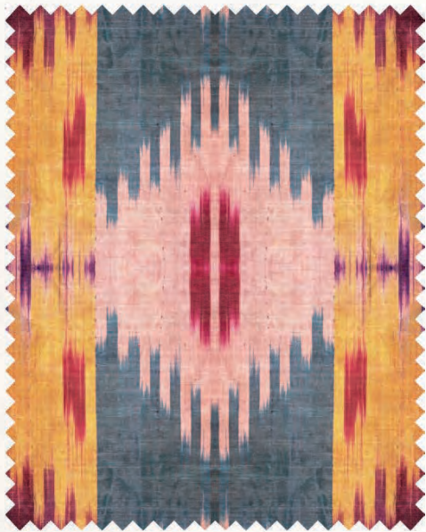
PATOLA / #FB00010