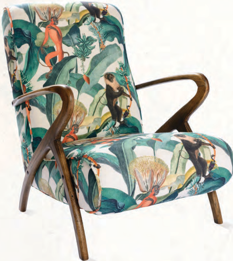
BERMUDA Armchair 66,5x85x82cm / #FR00002 Oak wooden frame