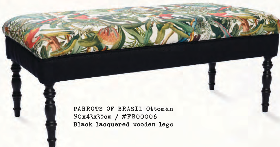
PARROTS OF BRASIL Ottoman 90x43x35cm / #FR00006 Black lacquered wooden legs