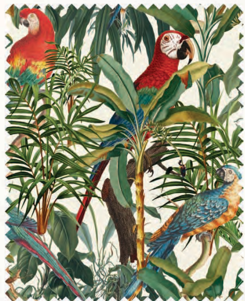
PARROTS OF BRASIL / #FB00008