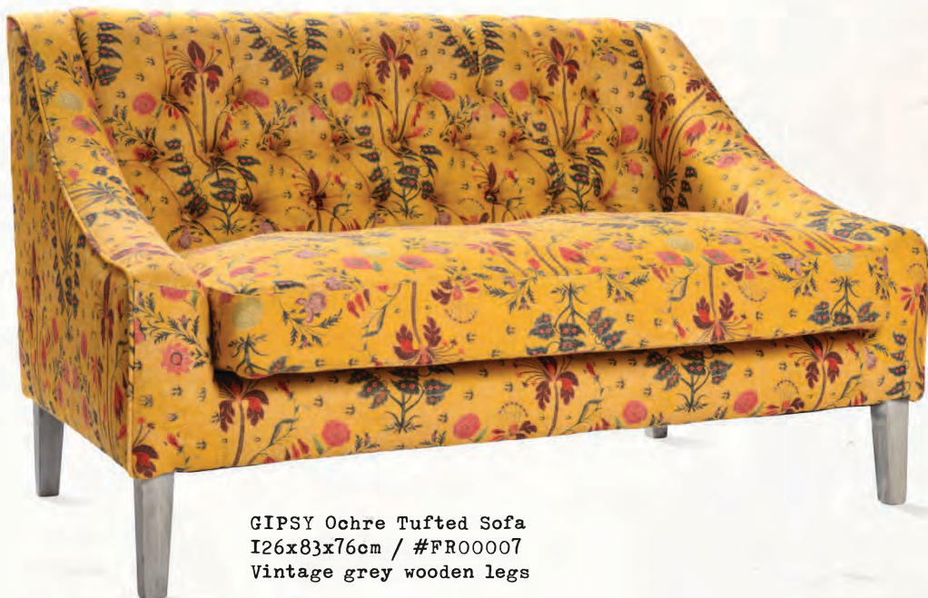
GYPSY Ochre Tufted Sofa 126x83x76cm / #FR00007 Vintage grey wooden legs