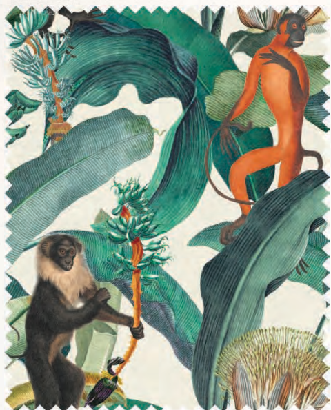
BERMUDA Heavy linen / #FB00007