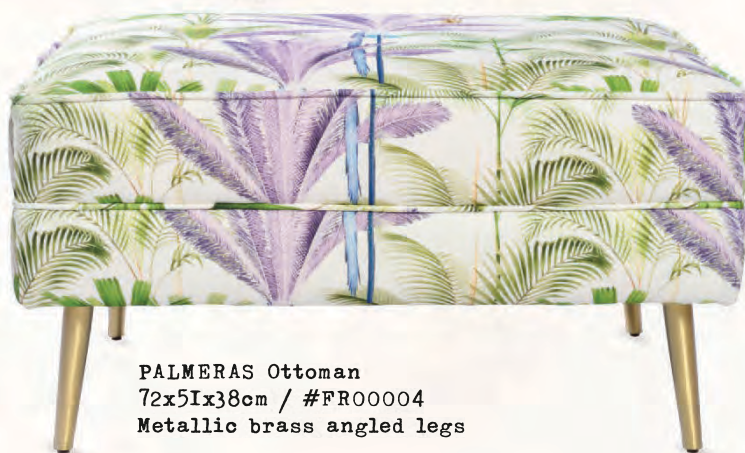
PALMERAS Ottoman 72x51x38cm / #FR00004 Metallic brass angled legs