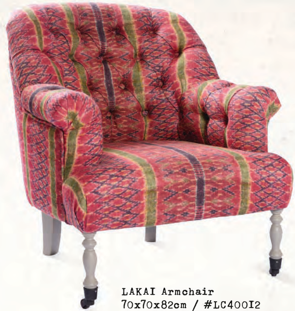
LAKAI Armchair 70x70x82cm / #LC400I2 Antique grey lacquered legs with metallic front wheels