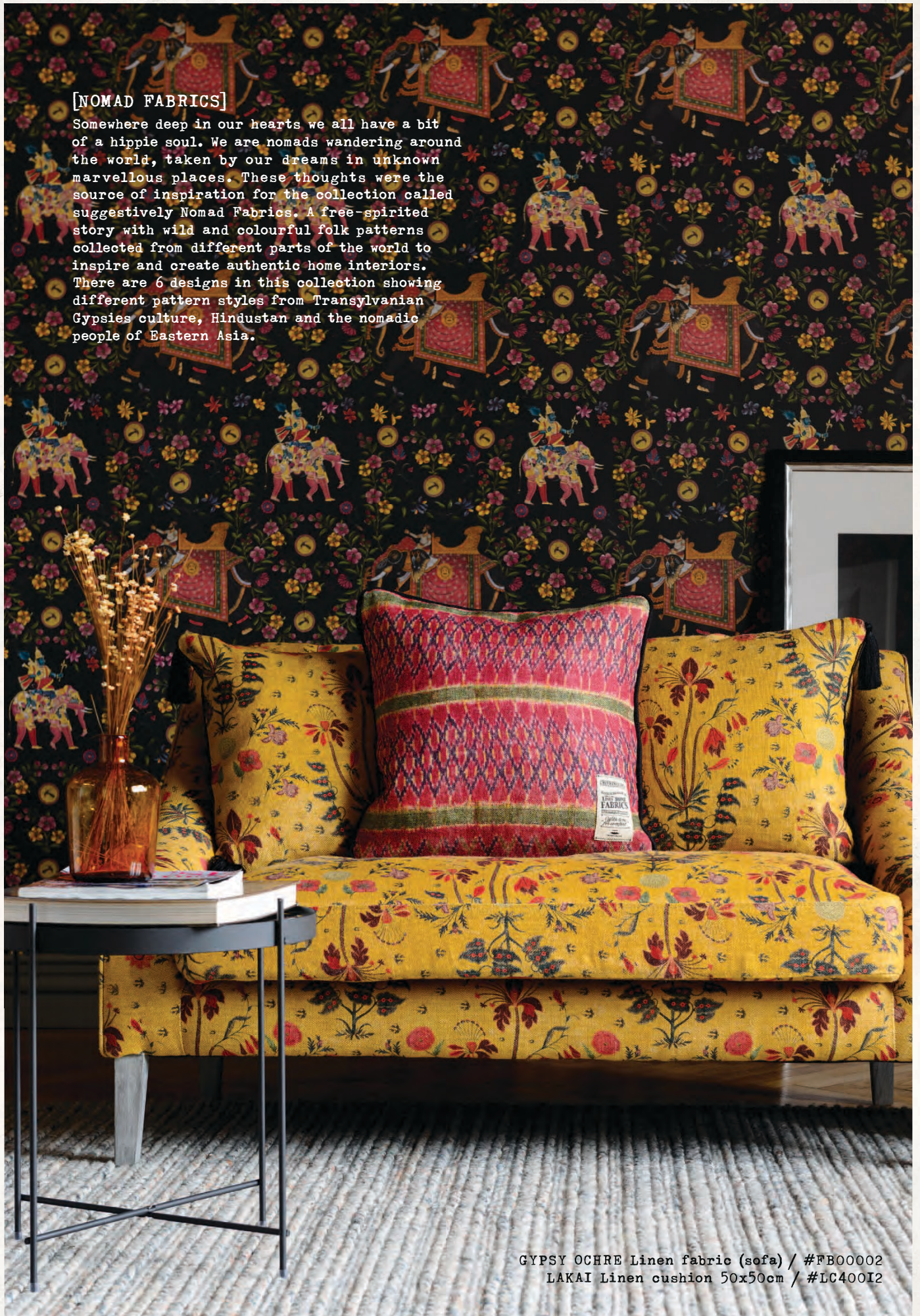
GYPSY OCHRE Linen fabric (sofa) / #FB00002 LAKAI Linen cushion 50x50cm / #LC400I2

Somewhere deep in our hearts we all have a bit of a hippie soul. We are nomads wandering around the world, taken by our dreams in unknown marvellous places. These thoughts were the source of inspiration for the collection called suggestively Nomad Fabrics. A free-spirited story with wild and colourful folk patterns collected from different parts of the world to inspire and create authentic home interiors. There are 6 designs in this collection showing different pattern styles from Transylvanian Gypsies culture, Hindustan and the nomadic people of Eastern Asia.