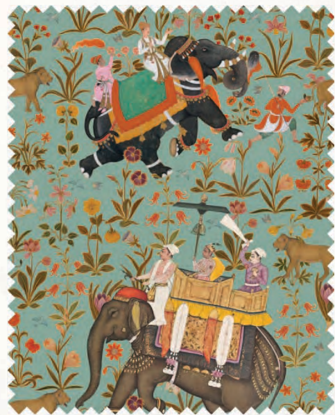
HINDUSTAN Aquamarine / #FB00011