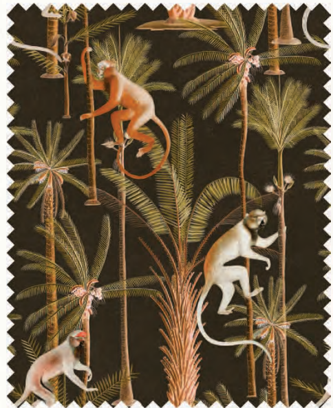
BARBADOS Anthracite / #FB00001