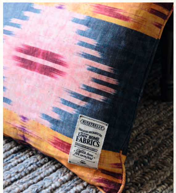
PATOLA Linen Cushion - An outstanding design featuring a woven sari with an attractive pattern from Rajasthan, India.

The collection is made on two different linen grades, both 100% natural. One is the 420 gm cloth suitable for soft furnishing, cushions or accessories and the other one is 540 gm and is proper for upholstery, draperies and any other kind of home decor. Both fabrics are stonewashed finished for more softness and to get a vintage look.