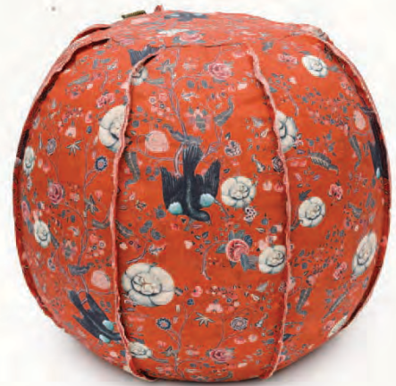
BLACK BIRD Linen Pouf 60x60cm / #FR00012