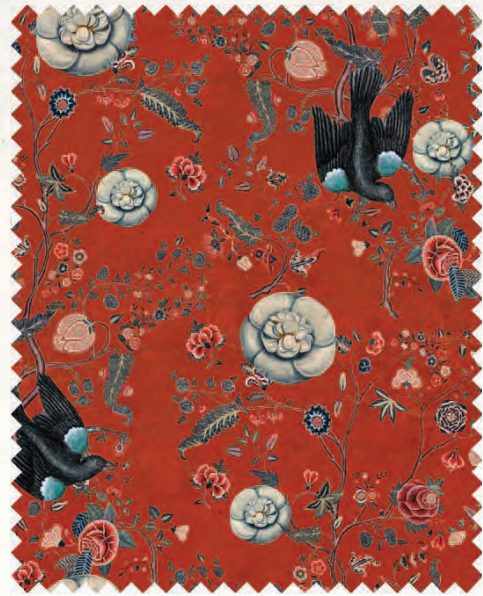
BLACK BIRD / #FB00009