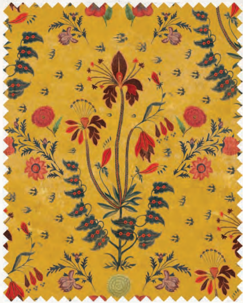
GYPSY Ochre Heavy linen / #FB00002