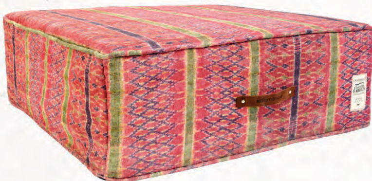
LAKAI Floor Cushion 90x90x33cm / #FR000I4 Suede leather handle