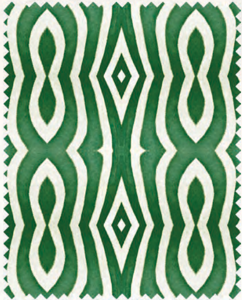
RIVERSIDE Heavy linen / #FB00003