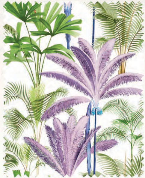
PALMERAS / #FB00006