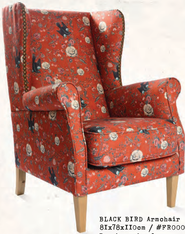
BLACK BIRD Armchair 81x78x110cm / #FR00001 Beech wooden legs