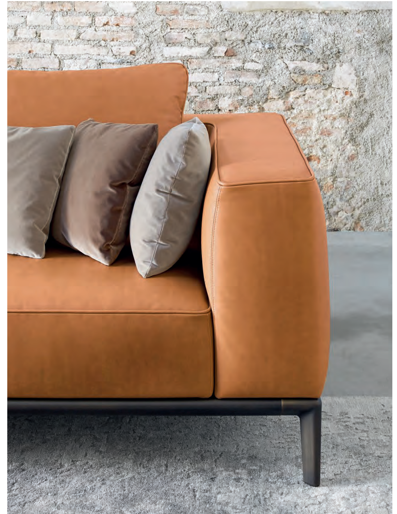
MILO SOFA Design Stefano Giovannoni