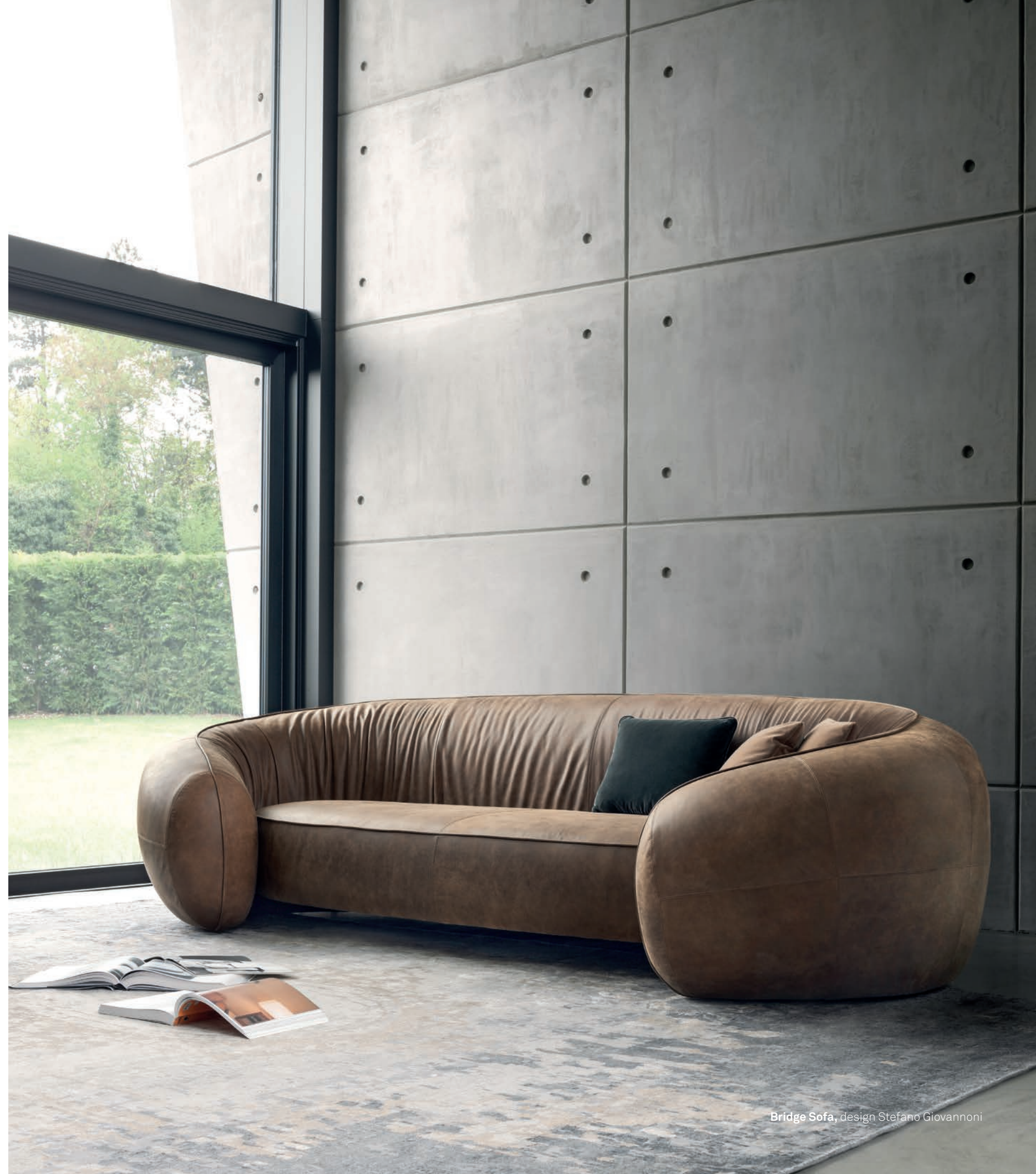
Bridge Sofa, design Stefano Giovannoni