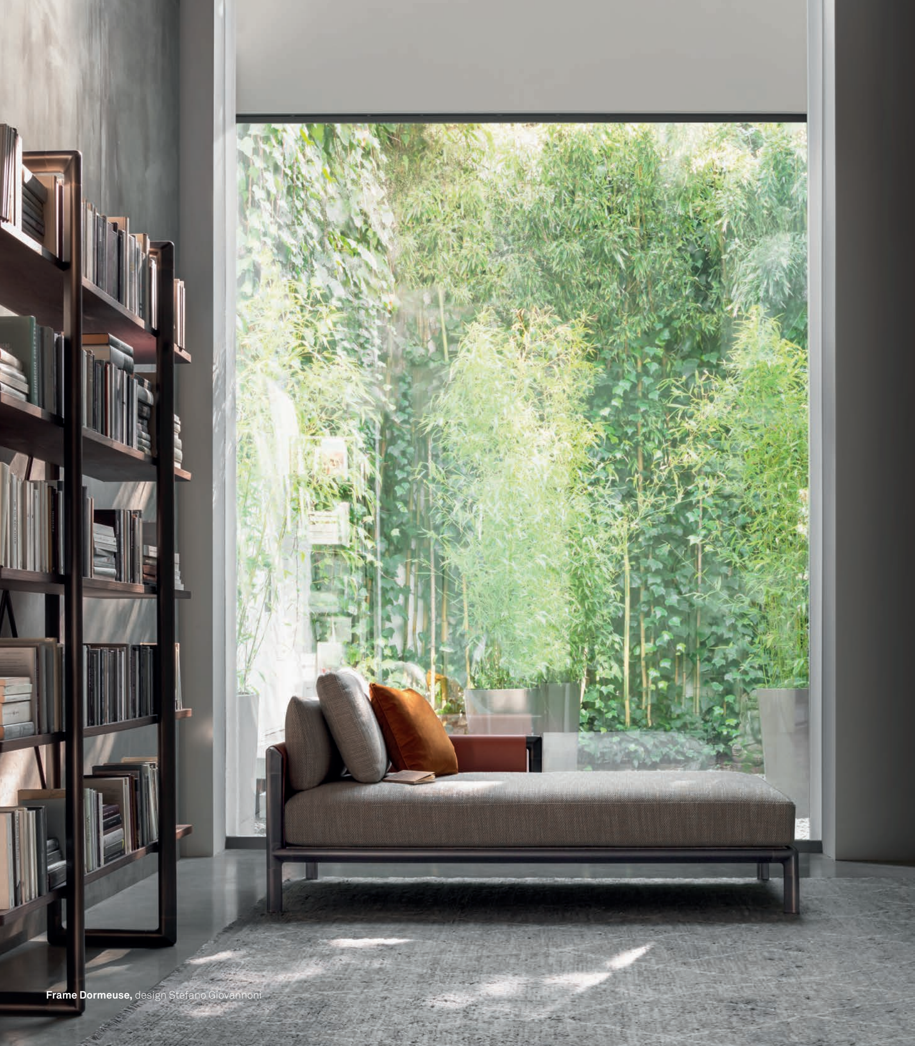
Frame Dormeuse, design Stefano Giovannoni