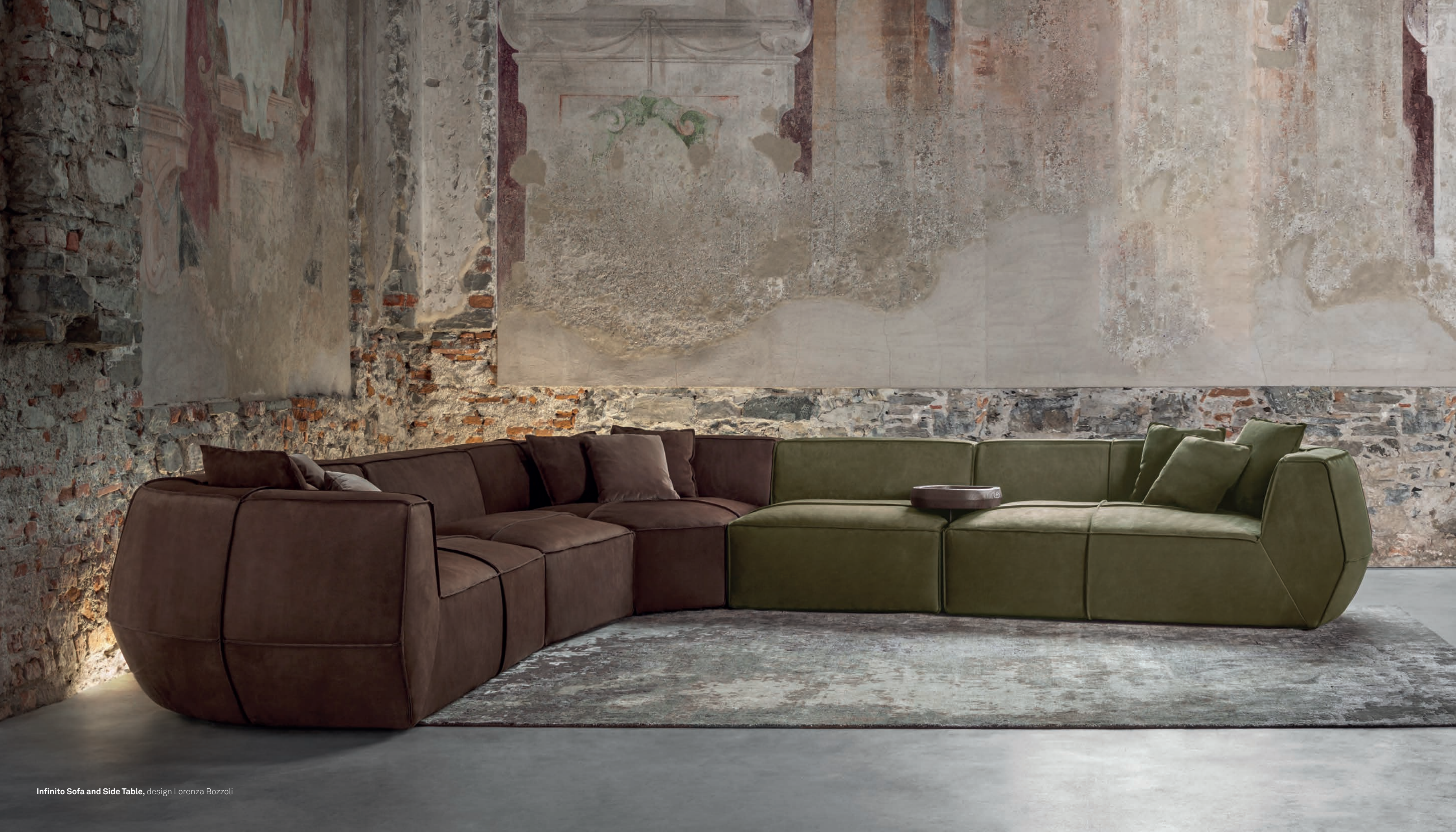
Infinito Sofa and Side Table, design Lorenza Bozzoli