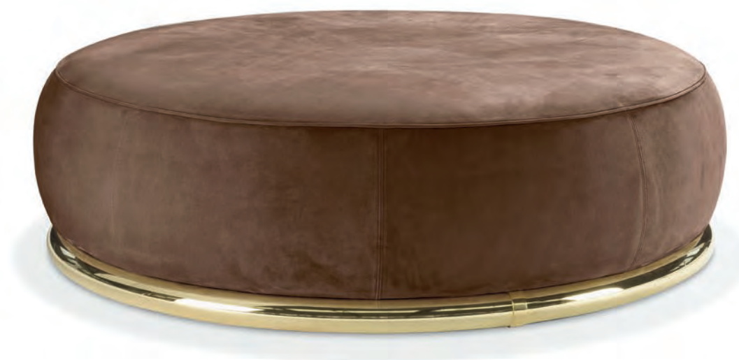
ABBRACCI OTTOMAN Design Lorenza Bozzoli