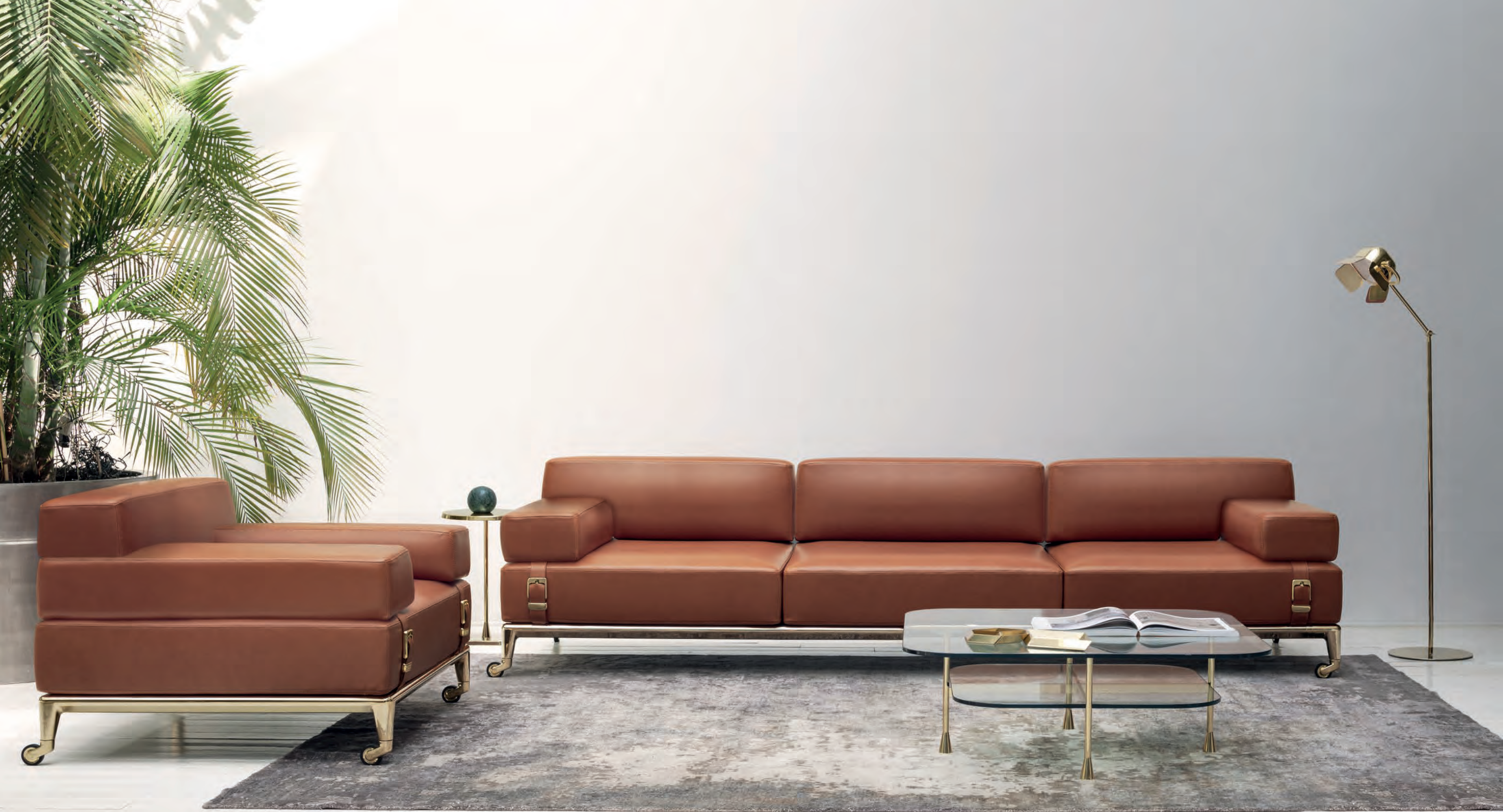
Shaker Sofa and Armchair, design Stefano Giovannoni