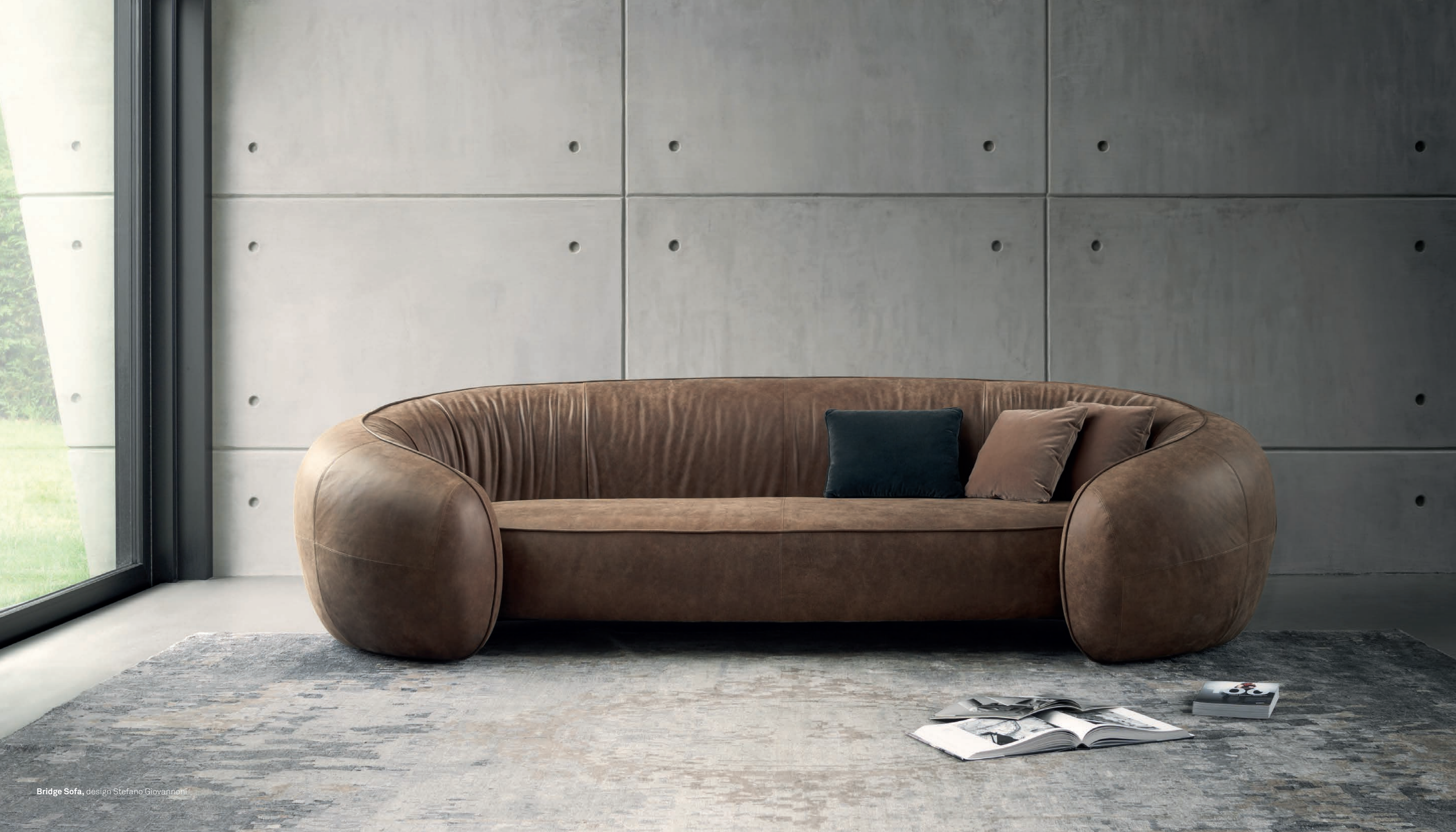
Bridge Sofa, design Stefano Giovannoni