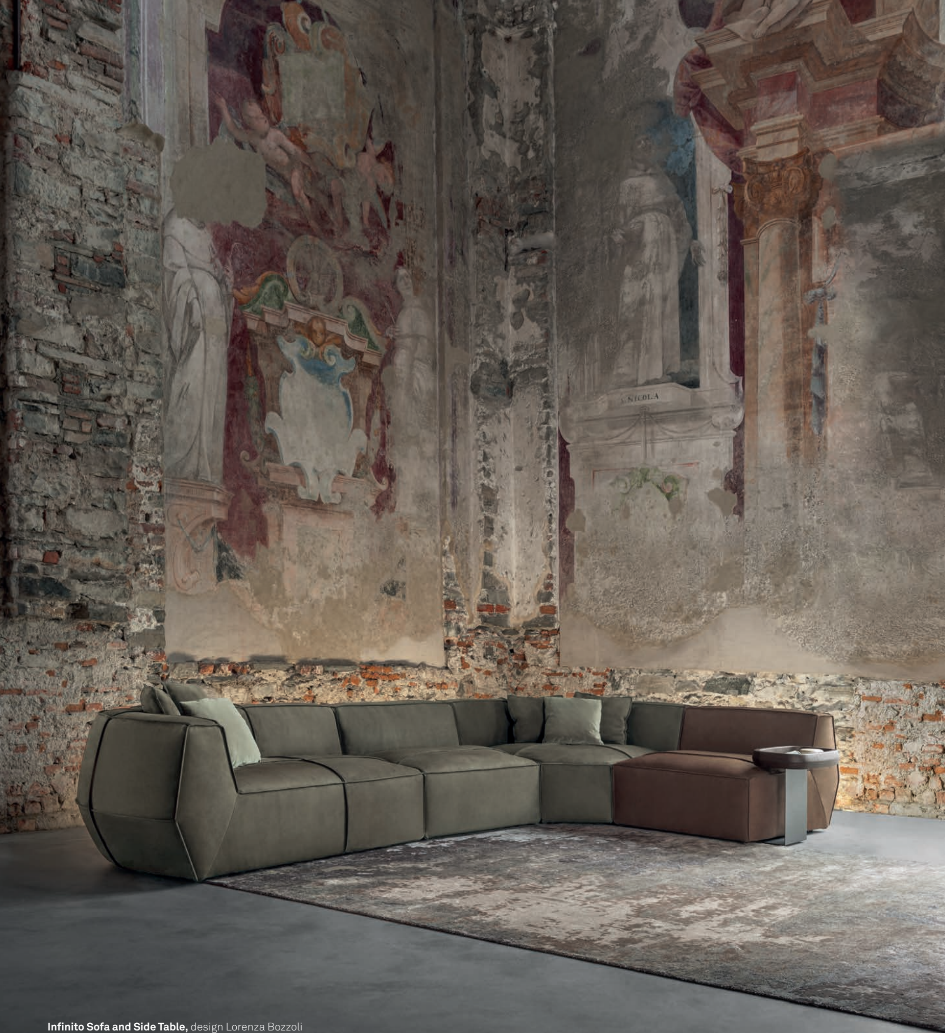
Infinito Sofa and Side Table, design Lorenza Bozzoli