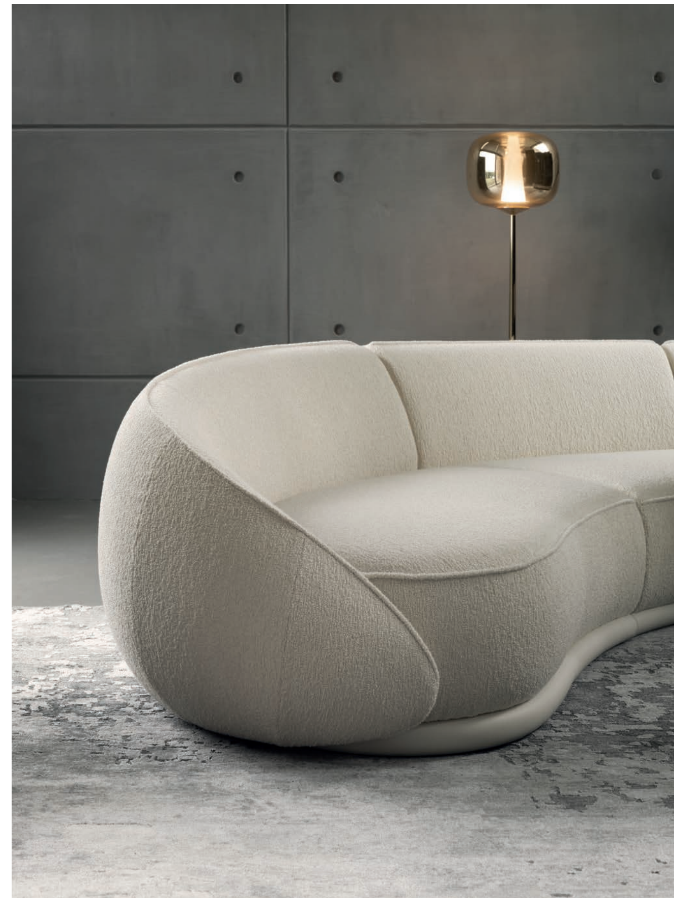
ABBRACCI MODULAR SOFA Design Lorenza Bozzoli