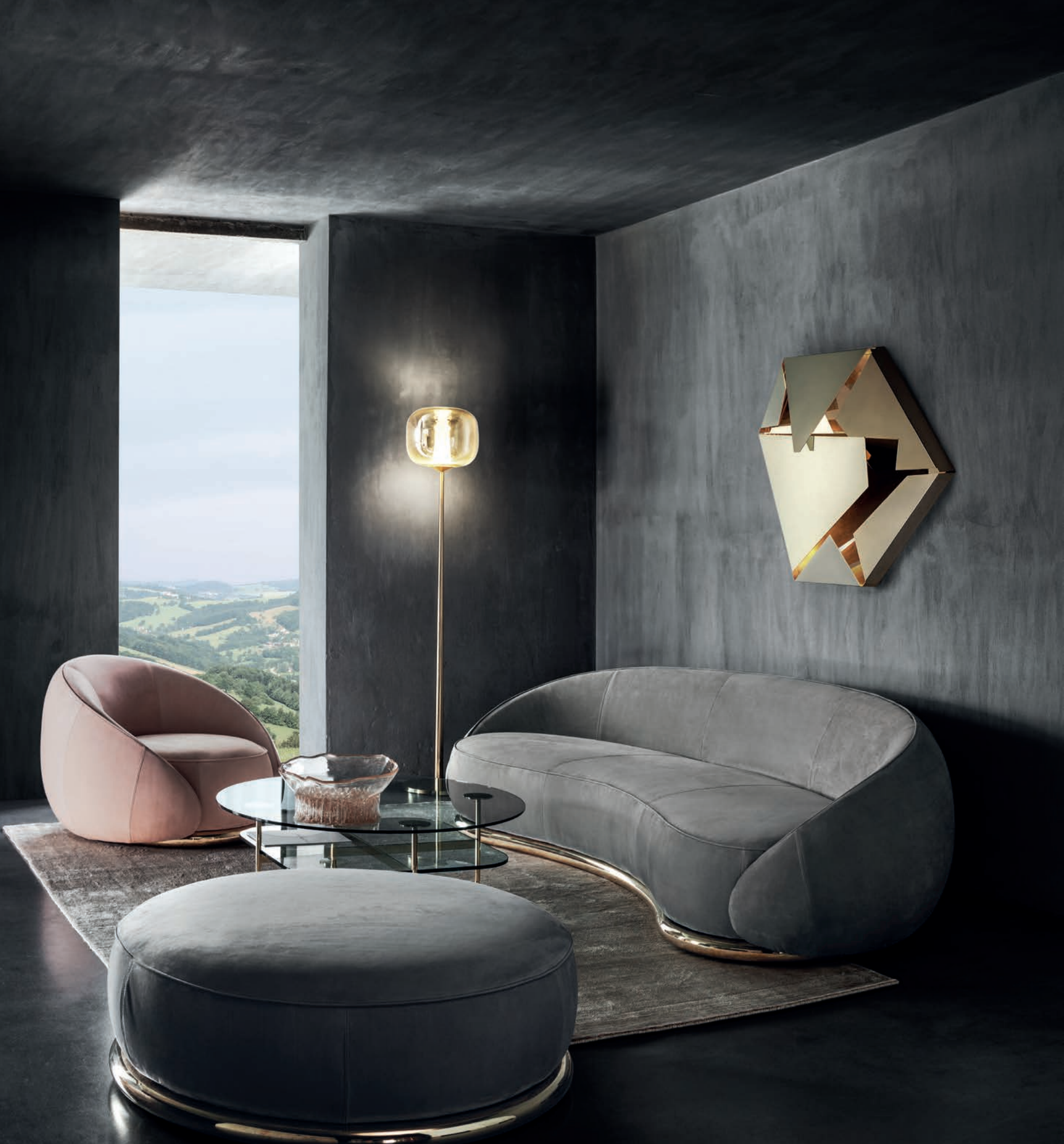
Abbracci Collection, design Lorenza Bozzoli