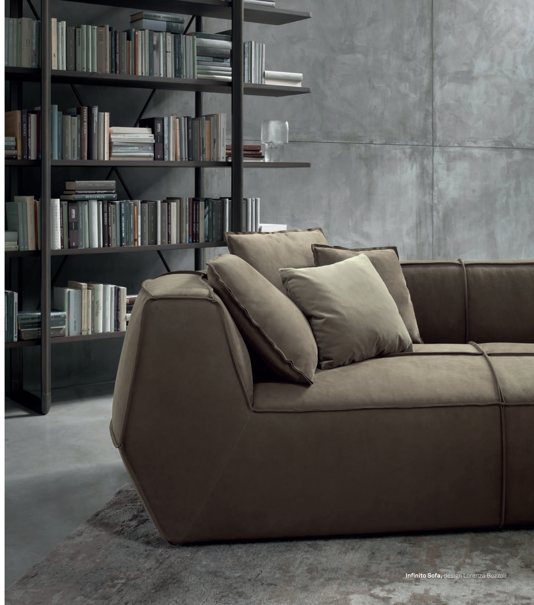
Infito Sofa , design Lorenza Bozzoli