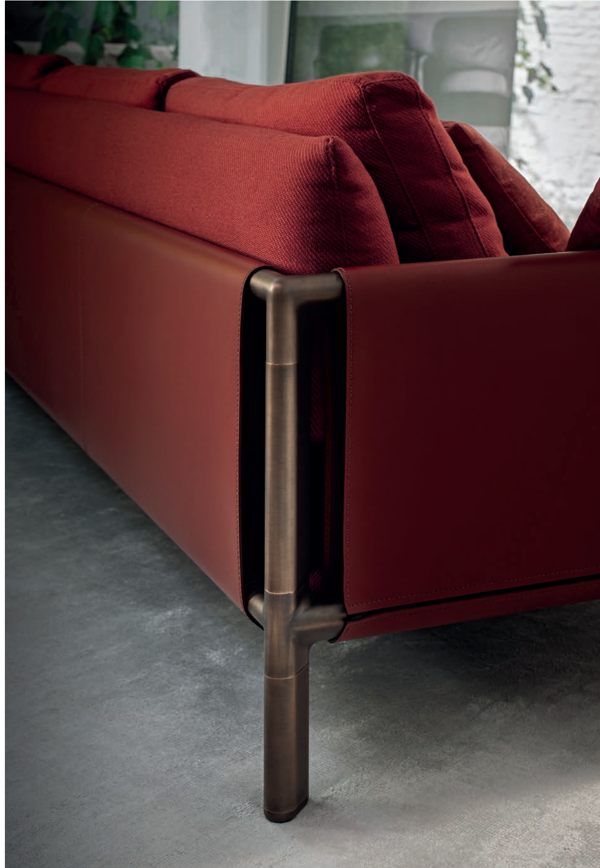
FRAME SOFA Design Stefano Giovannoni