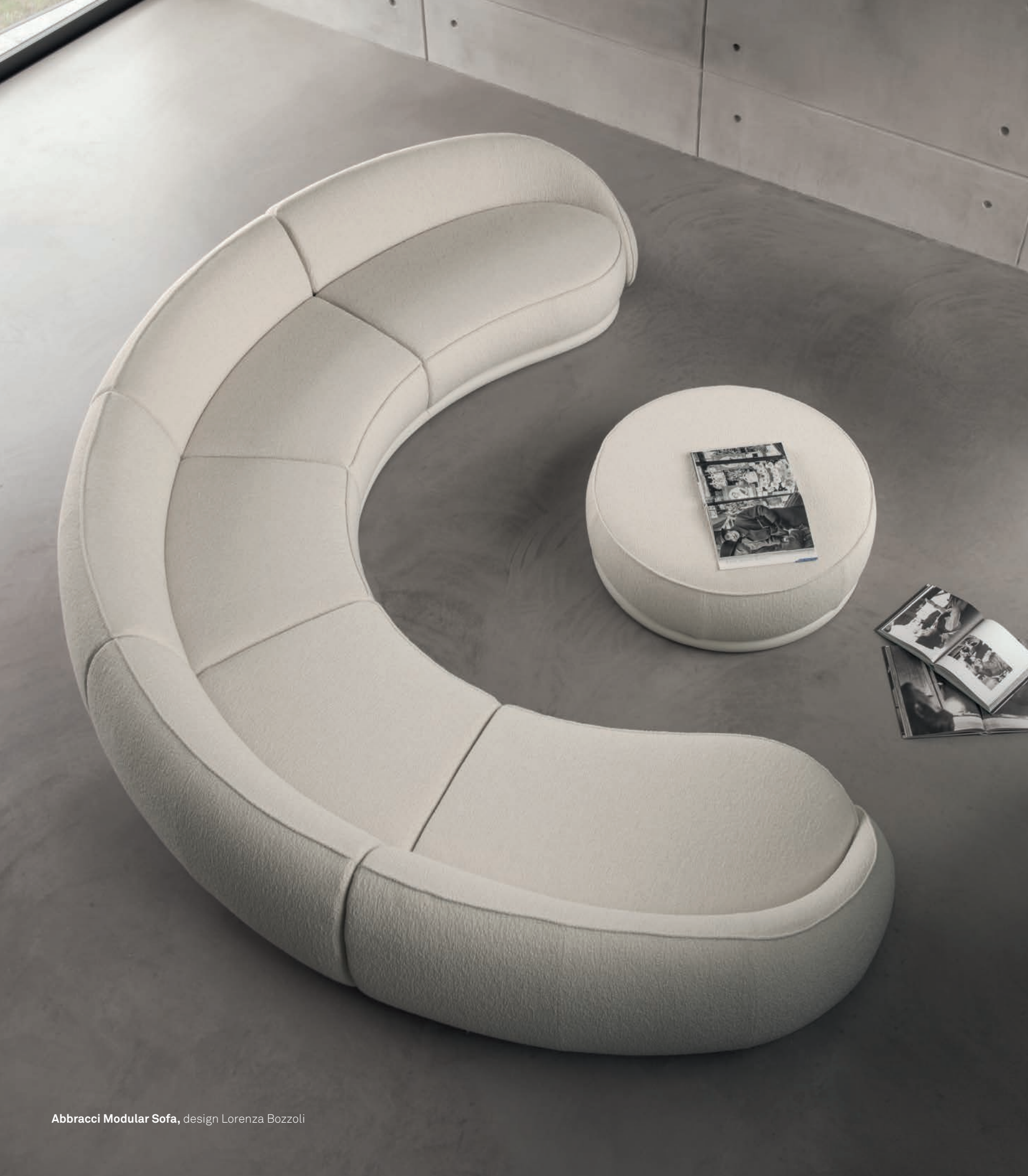
Abbracci Modular Sofa, design Lorenza Bozzoli