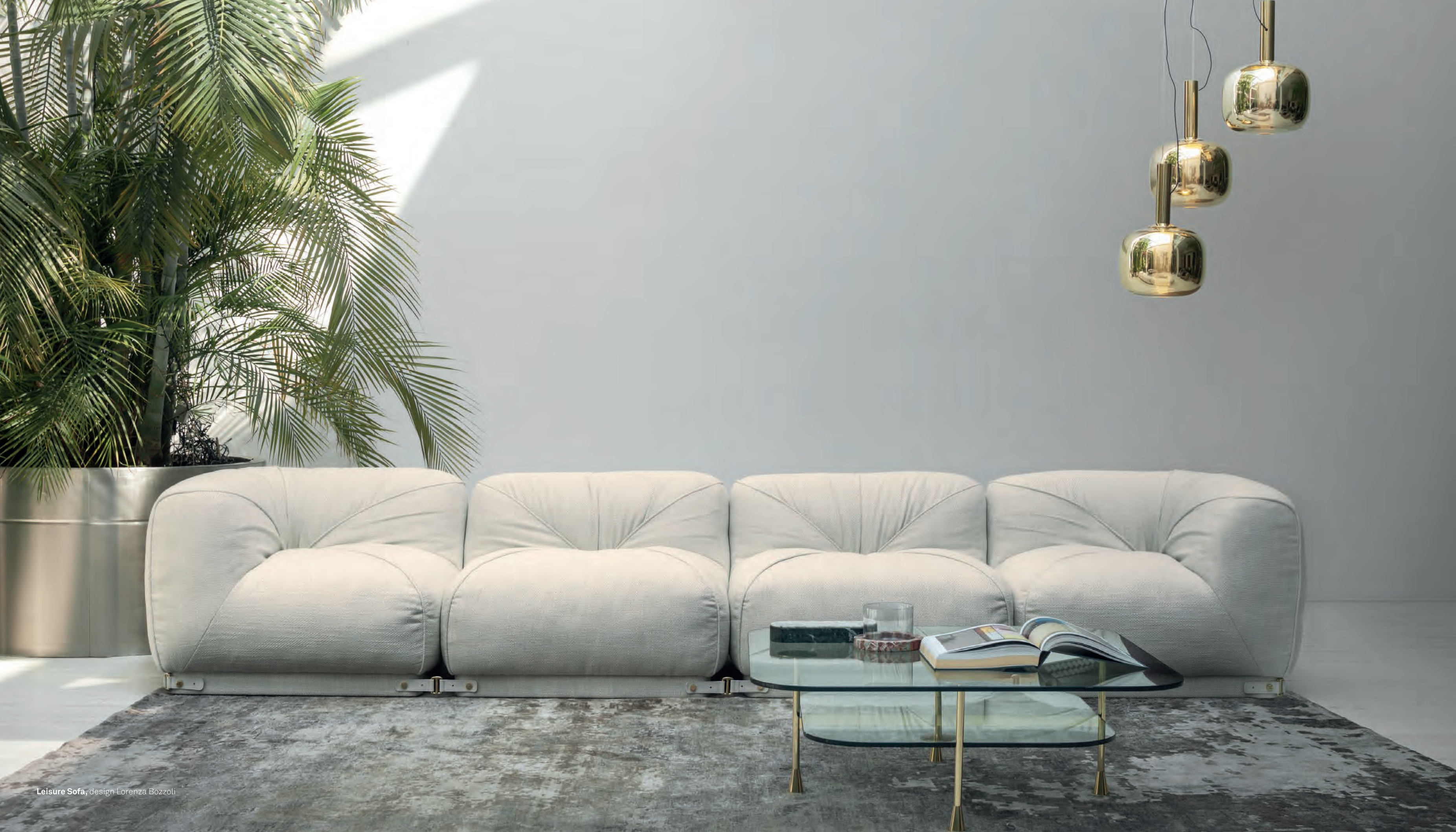
Leisure Sofa, design Lorenza Bozzoli