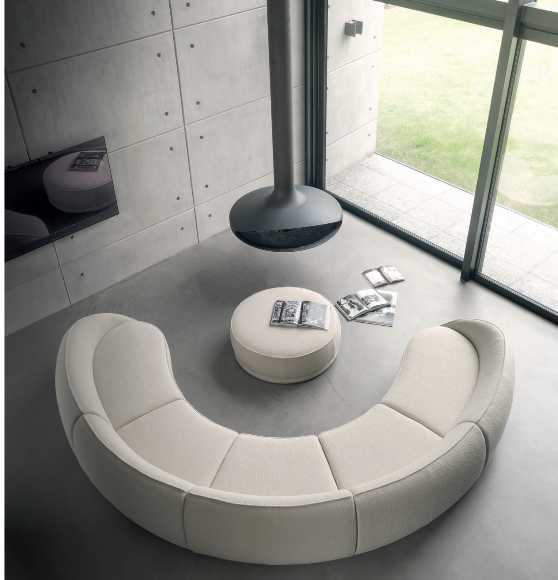
Abbracci Modular Sofa, design Lorenza Bozzoli