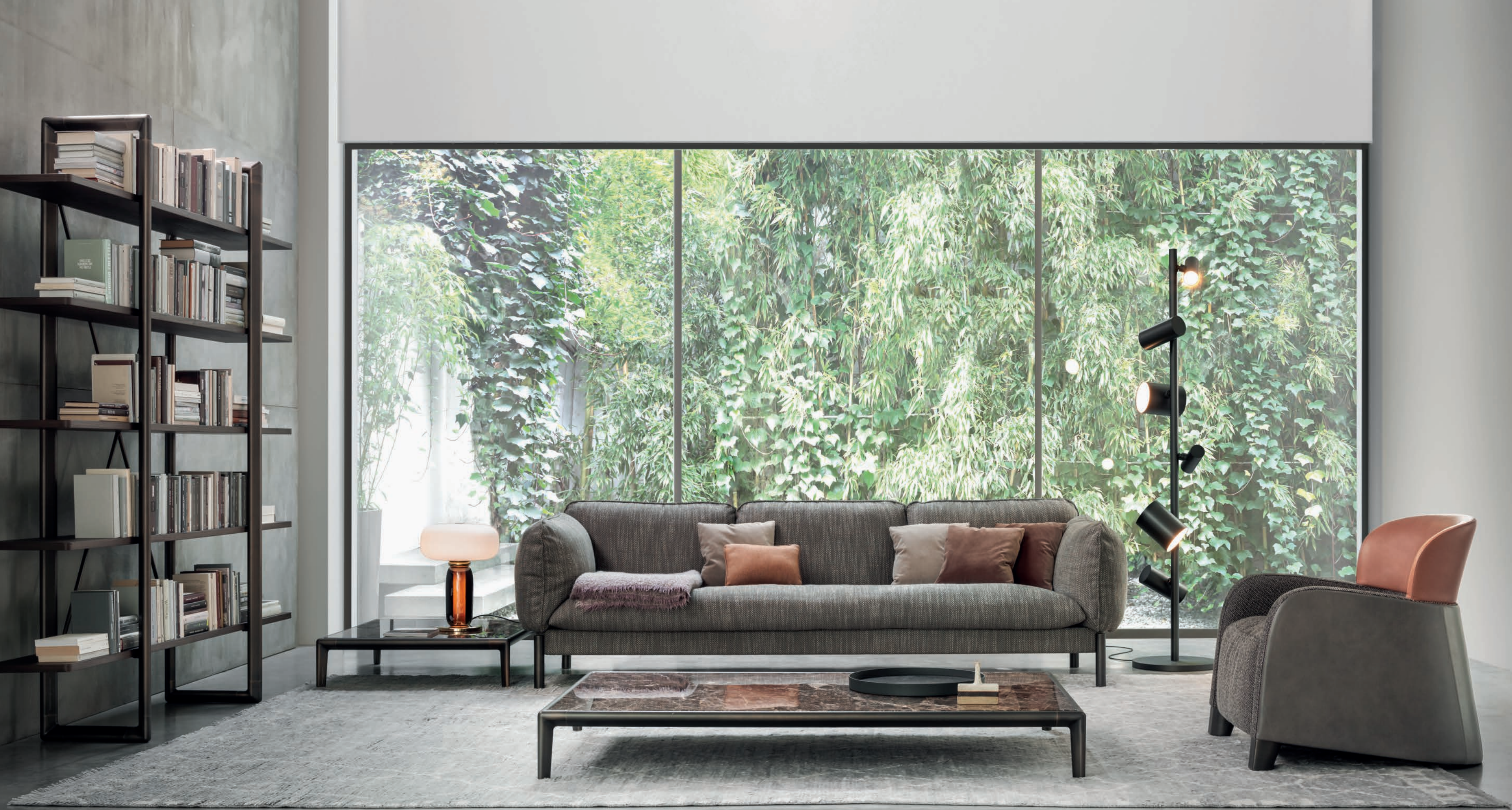
Tarantino Sofa, design Lorenza Bozzoli