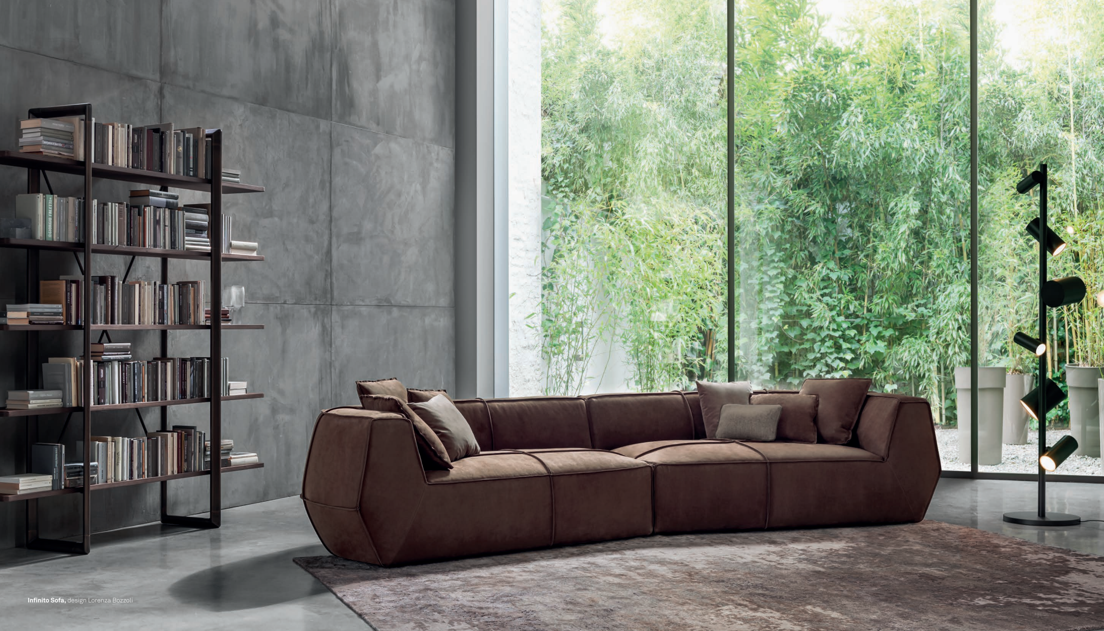
Infinito Sofa, design Lorenza Bozzoli