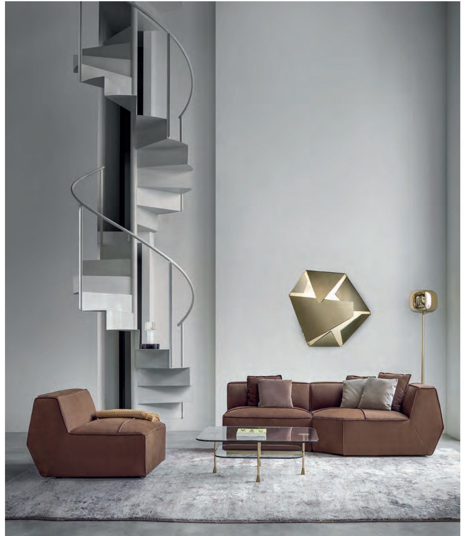
INFINITO SOFA Design Lorenza Bozzoli