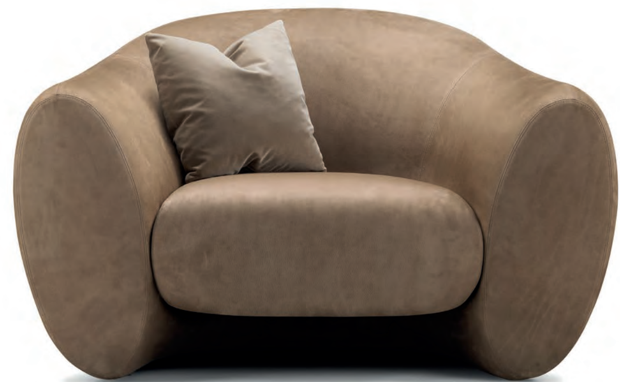
ELEPHANT ARMCHAIR Design Stefano Giovannoni