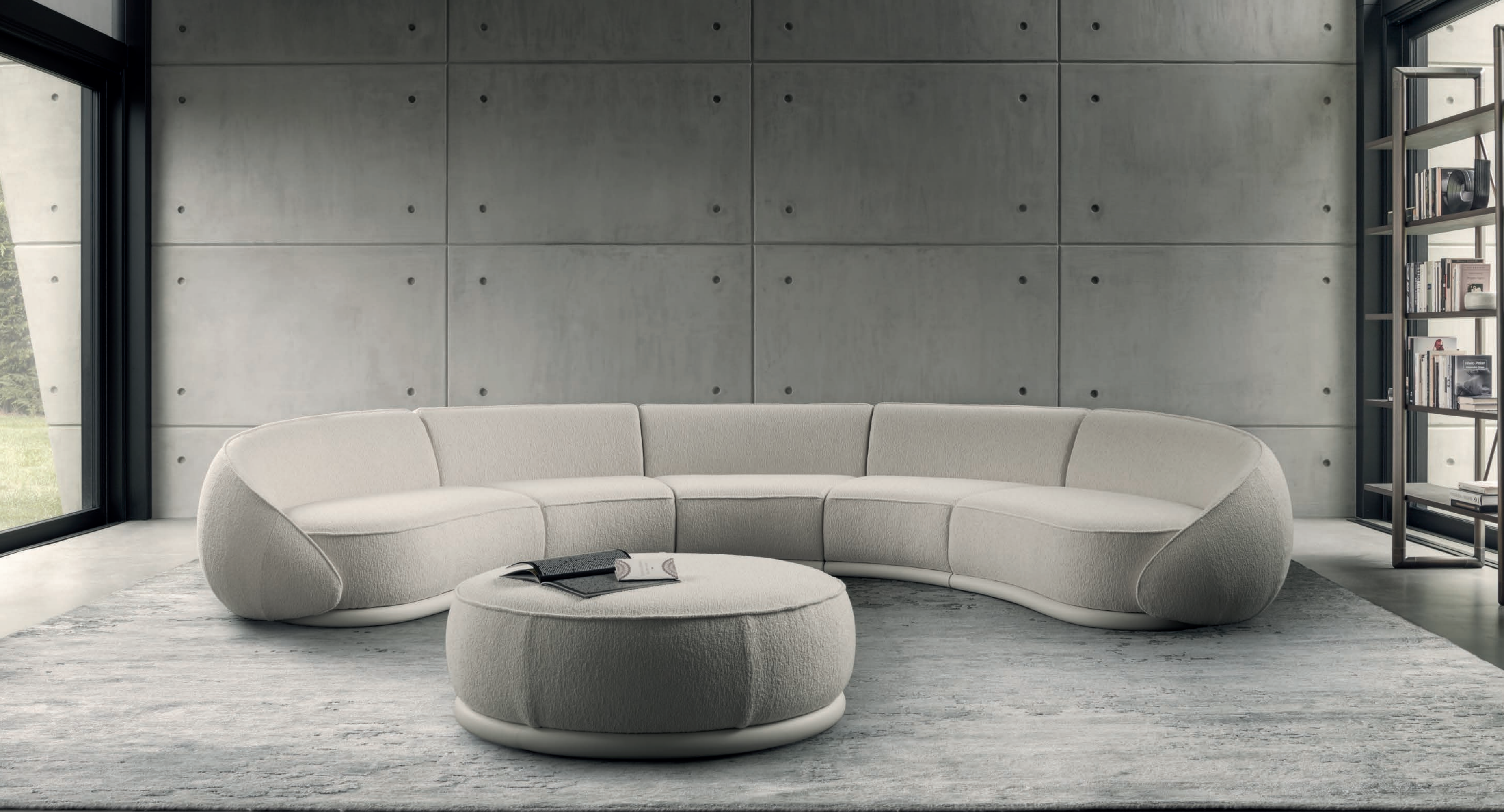
Abbracci Modular Sofa, design Lorenza Bozzoli