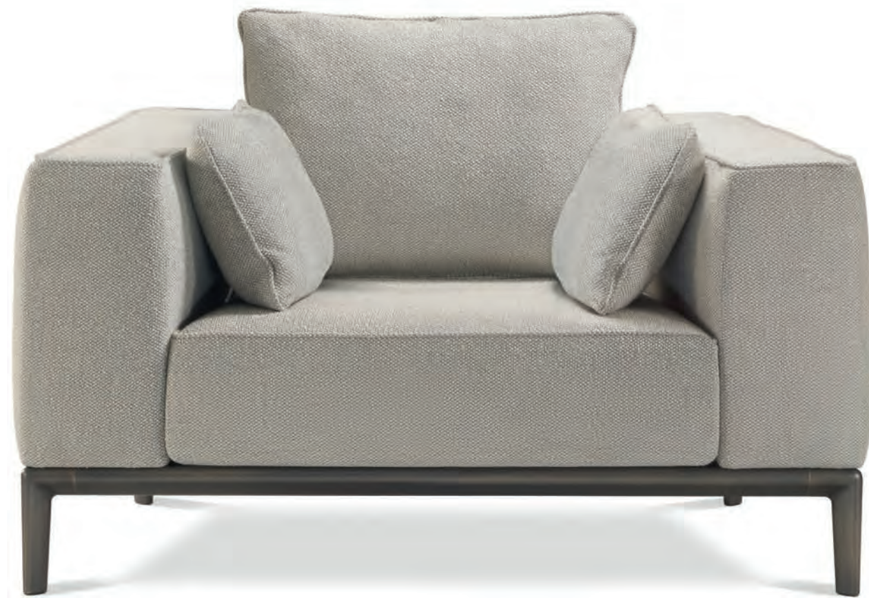
MILO ARMCHAIR Design Stefano Giovannoni