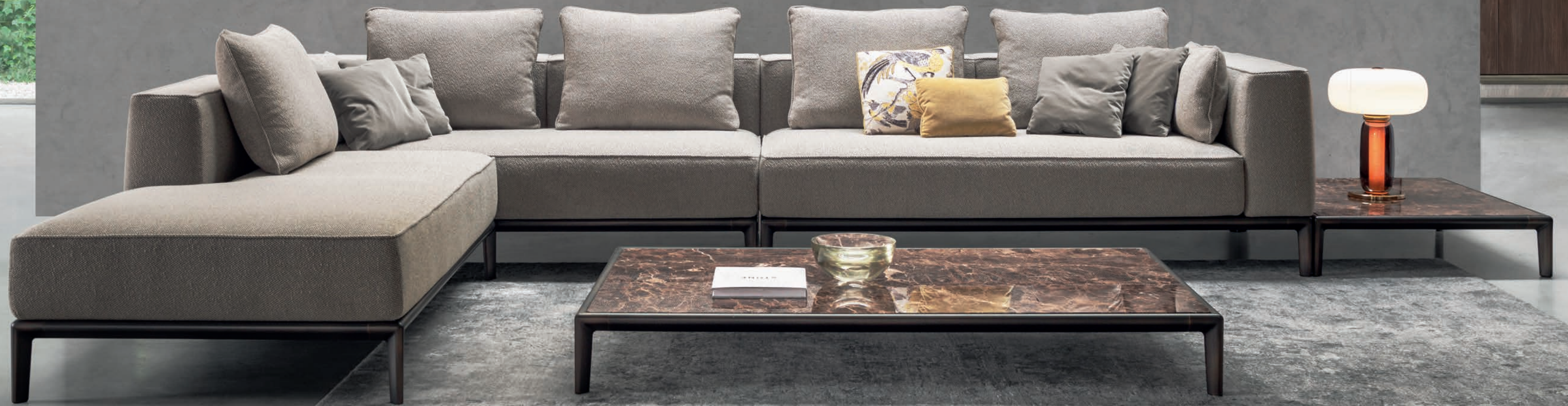
Milo Sofa, design Stefano Giovannoni