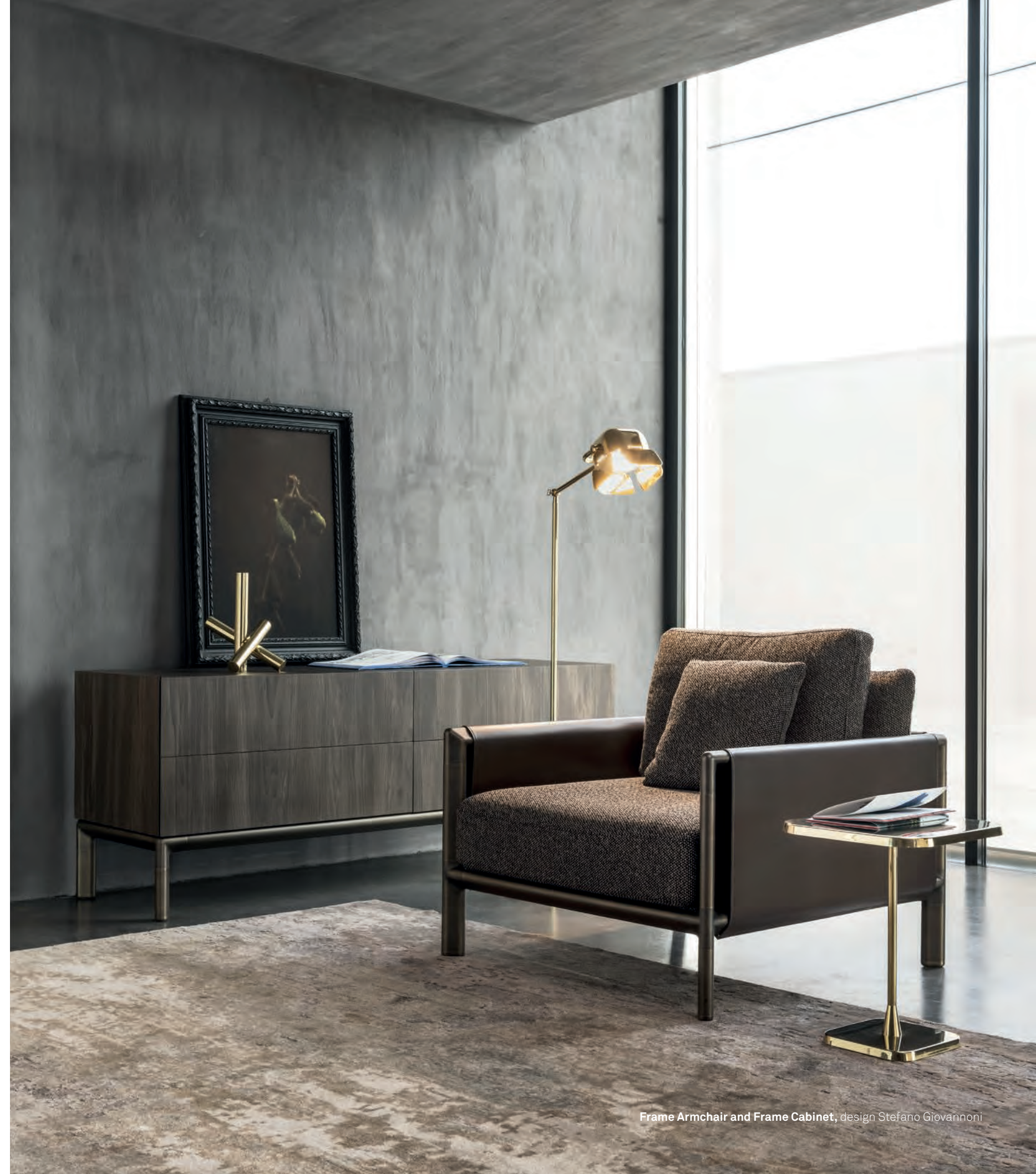
Frame Armchair and Frame Cabinet , design Stefano Giovannoni