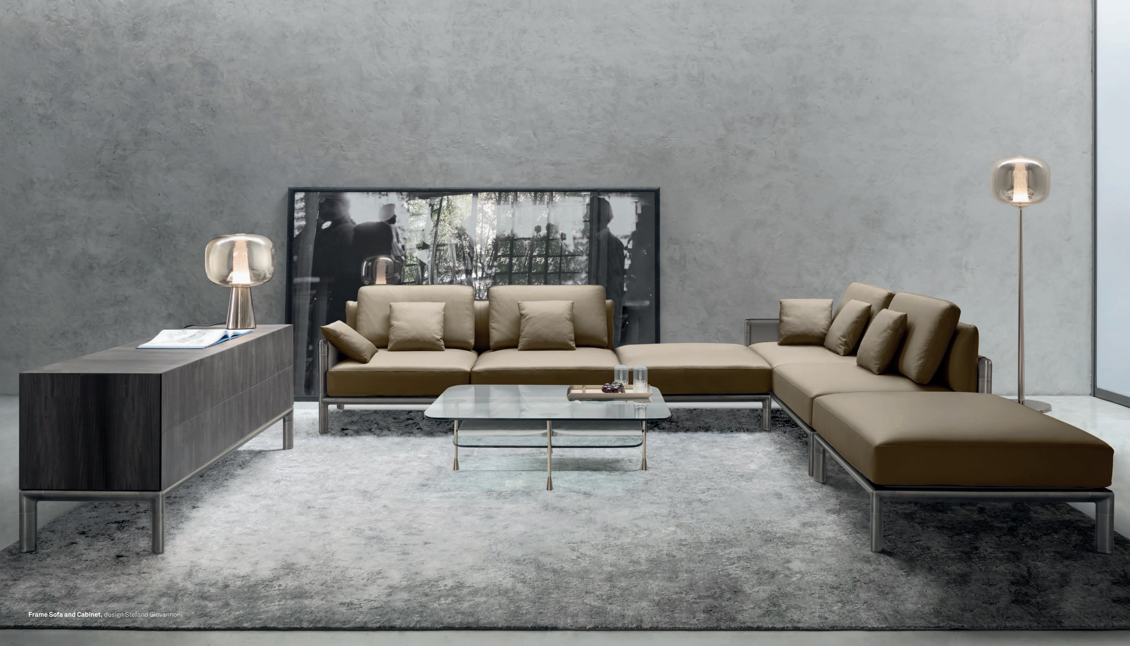
Frame Sofa and Cabinet, design Stefano Giovannoni