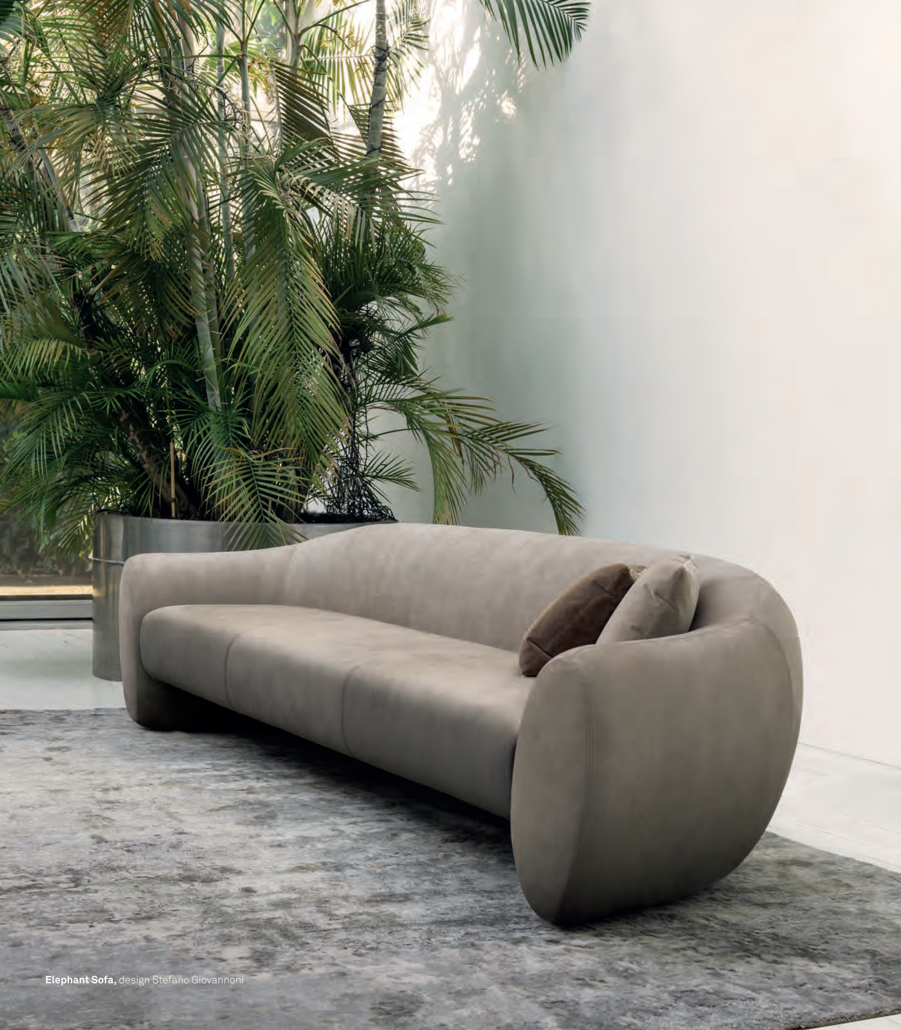
Elephant Sofa, design Stefano Giovannoni