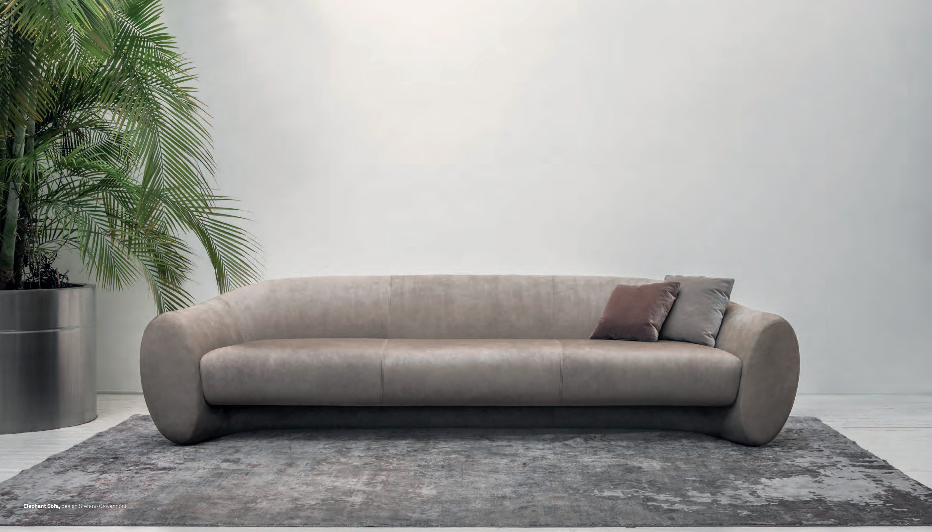
Elephant Sofa, design Stefano Giovannoni