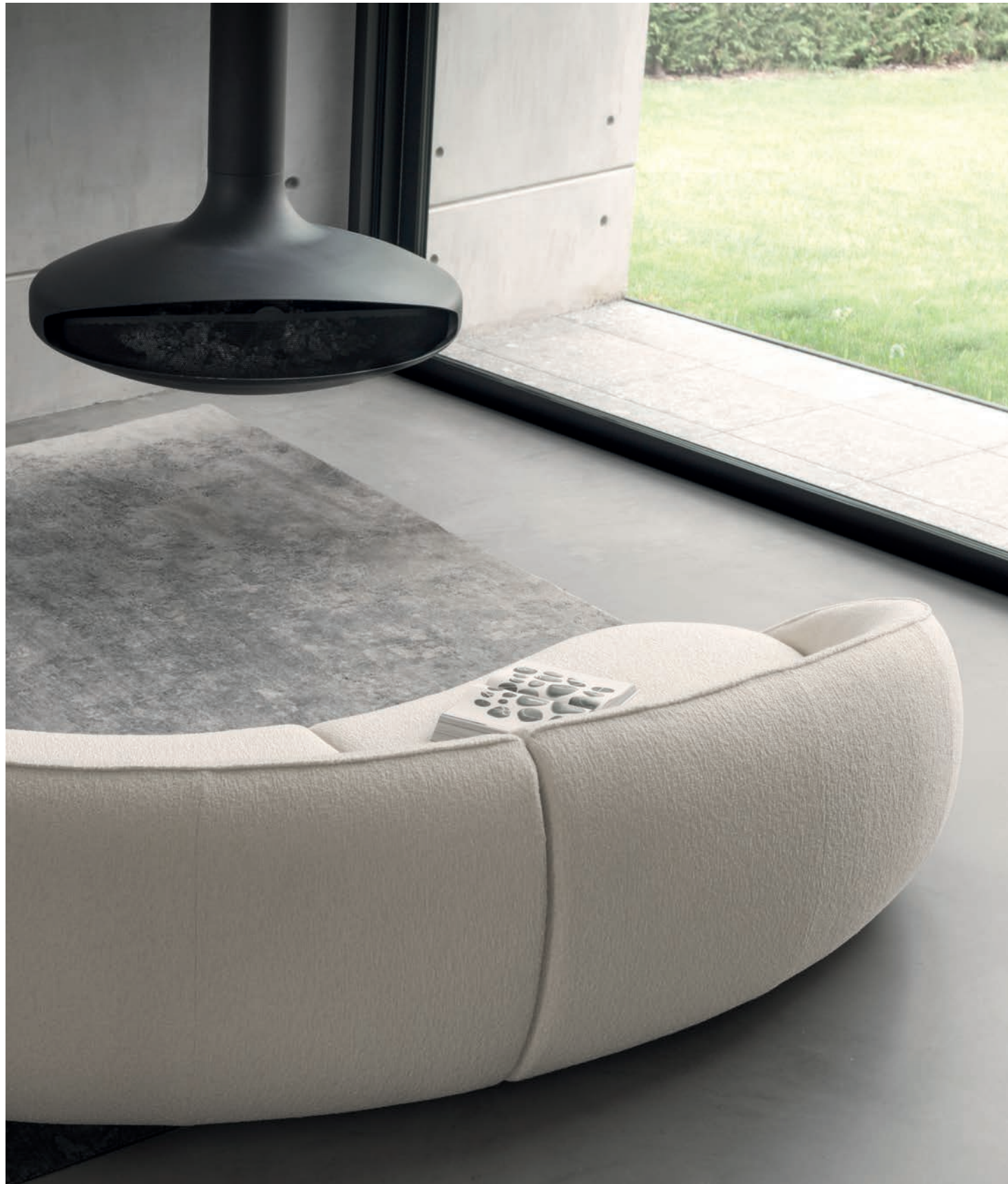
ABBRACCI MODULAR SOFA Design Lorenza Bozzoli