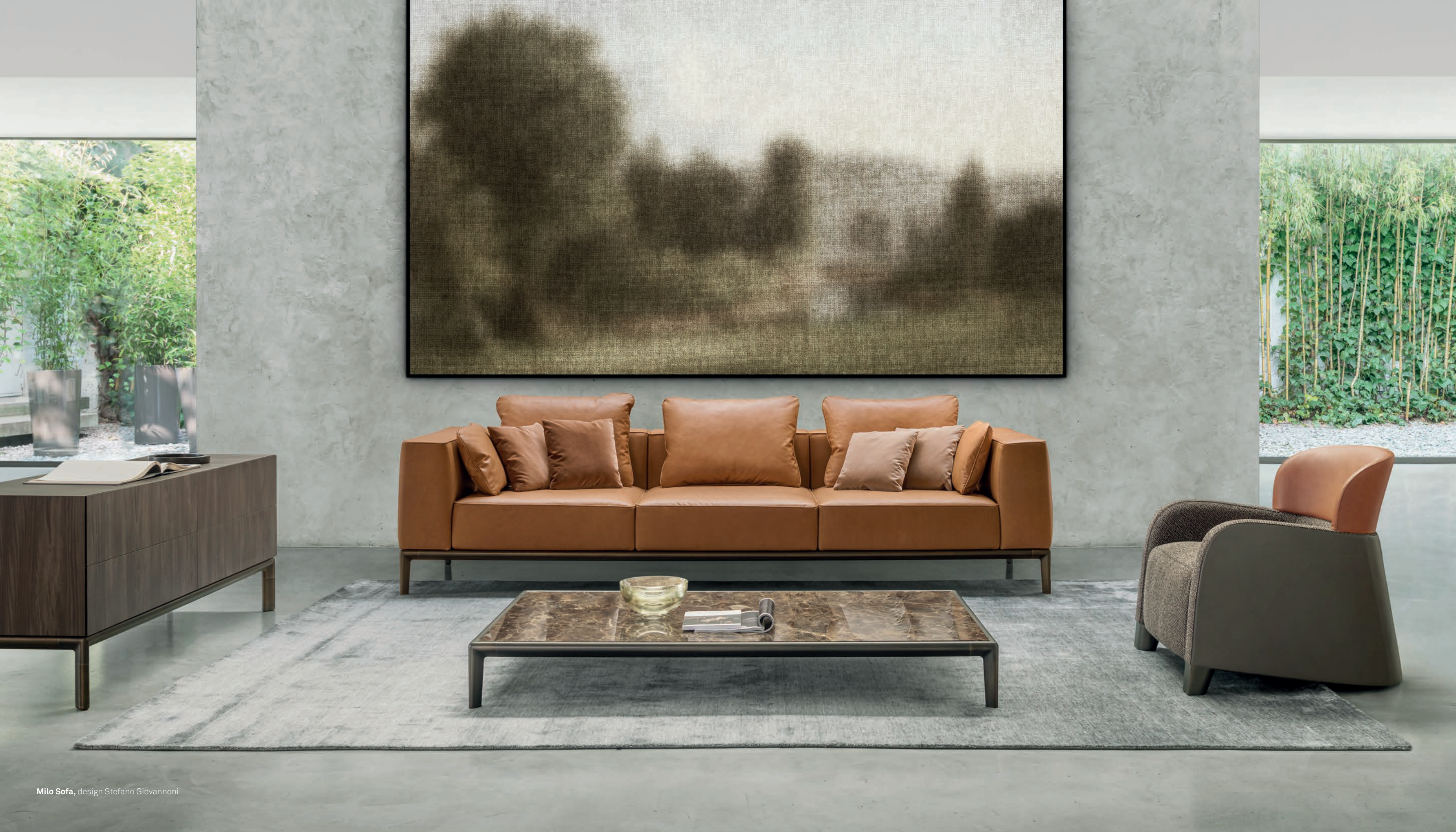
Milo Sofa, design Stefano Giovannoni