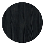
Fresno negro Black Ash