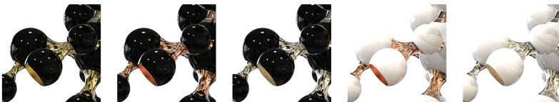
Black & Gold