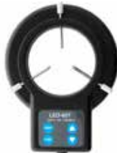
48 or 60 Bulb Variable LED Ring Light