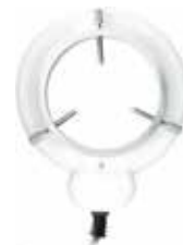
Fluorescent Ring Light