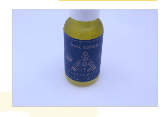
Unit: 12oz (342g) | Units Per Package:1