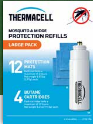
Large Refill Pack CODE: THC4