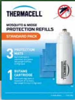
Standard Refill Pack CODE: THC1

Compatible with all Thermacell® mats and fuel-powered protectors. Refills are available in 3 different sizes.