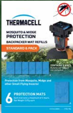
Standard 6 Pack CODE: THCM-24