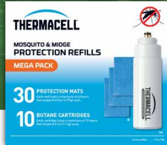
Mega Refill Pack CODE: THC10