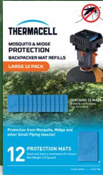
Large 12 Pack CODE: THCM-48