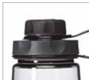
Rubberized grips on the small cap.