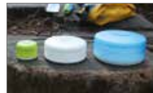
Available in three convenient sizes.