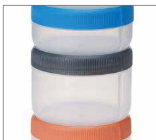
Side ribs align to confirm containers are sealed.