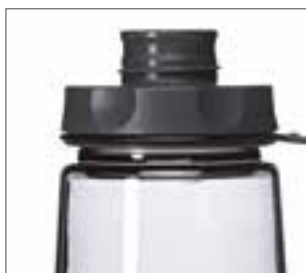
Splash-free spout for easy drinking.

Item# Model Size Colour HG0525 CapCAP+ 63mm ■ black