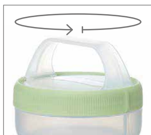
Containers click together and open/close with a simple 180° twist.