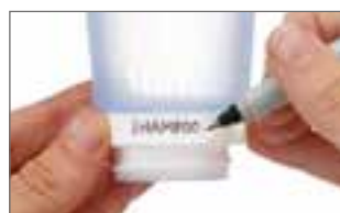
Textured writing area.