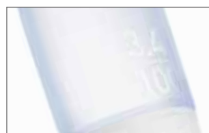
Clearer size labelling.