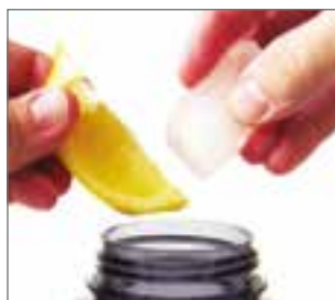
Wide opening for cleaning or adding fruit/ice.