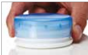
Just squeeze the sides and the lid is released.