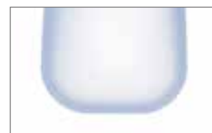
Stand up base for easier, hands-free filling.