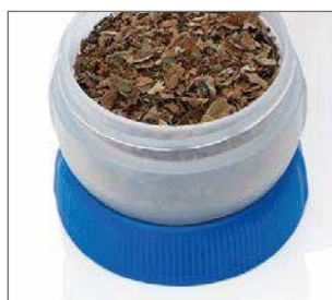
Lids store on container bases – no lost lids.