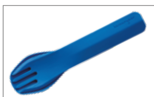
In nesting mode, Duo is fantastically compact.