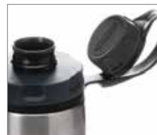
New CapKeeper holds cap in place whilst in use.