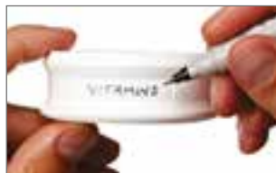
Recessed, textured writing area.