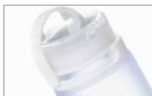
Lock mode is 20 times more resistant to leaks and accidental opening.