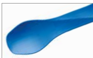
Large spoon form and low curvature edges help you slurp and scrape.

GoBites™ are made from extremely durable nylon and backed by a lifetime warranty. GoBites™ are also BPA-free, PC-free and phthalate-free.