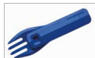
Click is the most compact members of the GoBites™ family.