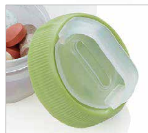
ClipHandle securely attaches to a backpack