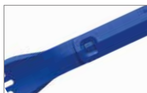
Click features a unique sliding-locking mechanism.