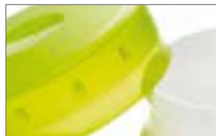
Transparent tops for ease of viewing.