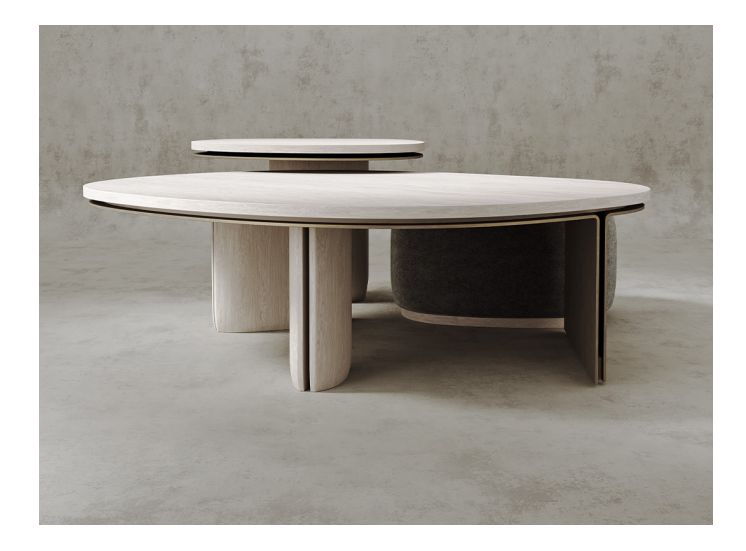
SHOWN IN QUARTZ & DISTRESSED BRASS SIZE COFFEE TABLE: 48" x 39" x 15" H SATELLITE TABLE: 26.5" x 22" x 18" H LARGE OTTOMAN: 31" x 25" x 12" H ADDITIONAL SMALL OTTOMAN: 23" x 18.5" x 12" H SKU DSRN-CT-01

200 LEXINGTON AVE. SUITE 611 | NY, NY 10016 P 212.353.2600 INFO@DESIRON.COM | DESIRON.COM