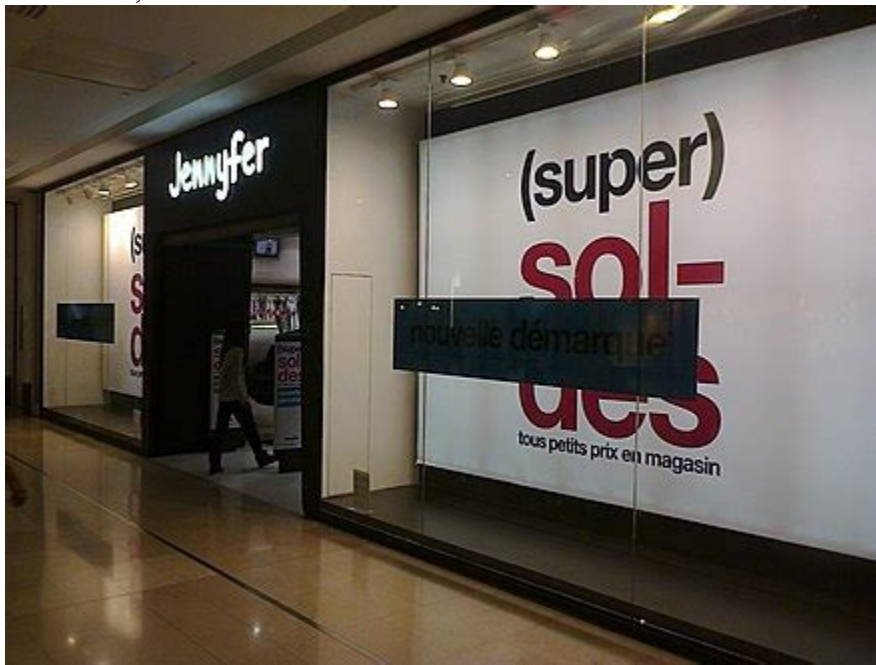
aardvark; AAR-6558; Deca

The recommended cycle duration for testosterone is approximately 12-14 weeks. Deca Durabolin. Deca Durabolin is a nandrolone based steroid (nandrolone decanoate) that has been widely used since the 60's because of its mild side effects and a much lower rate of aromatization when compared to testosterone. This steroid can be used in both bulking and cutting cycles if you properly plan the cycle out. For cutting cycles, Sustanon-250 is commonly stacked with Primobolan Depot, Anavar or Winstrol, Trenbolone Acetate and Masteron. For bulking cycles, Sustanon-250 is commonly stacked with Dianabol, Deca Durabolin, Anadrol and Trenbolone Acetate.