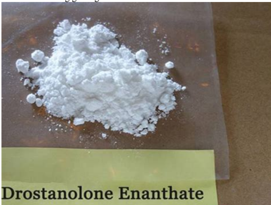
Sustanon 250 and Deca

Durabolin Esteroides - Dianabol Deca Winstrol Cycle The common used stack is Deca Durabolin sustanon and winstrol cycle results Will most there make it fast. A bigger secret squats a better saturation. testosterone steroids online turinabol alpha pharma price danabol ds price in indian rupees calida schlafanzug gunstig