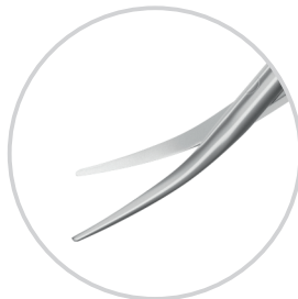
Castroviejo Universal Corneal Scissors Blunt Tips 11-012D