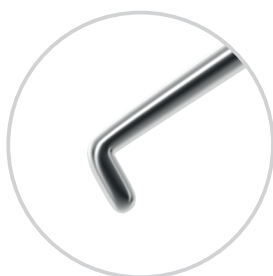
Sinsky Hook Angled 5-032D