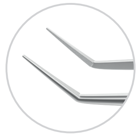
McPherson Tying Forceps Angled 4-174D