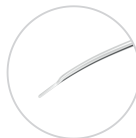
Spatula for Femtosecond Laser Procedure 20-204D