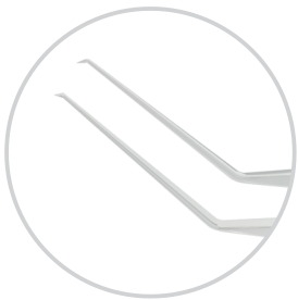
Utrata Capsulorhexis Forceps Cystotome Tips Straight 4-0311D