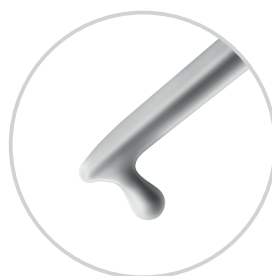
Lester Lens Manipulator Angled 5-0331D