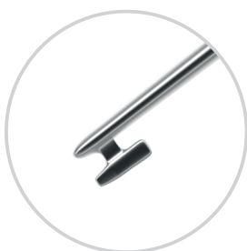
Kuglen Iris Hook Angled 5-030D