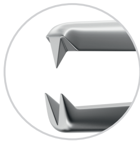
Bonn-Catalano Corneal Forceps 0.12 mm, 1x2 Teeth Straight 4-0551D