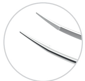
McPherson Tying Forceps Curved 4-177D