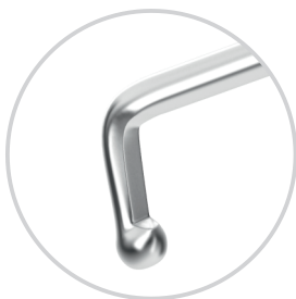
Nagahara Phaco Chopper RHD 7-063D