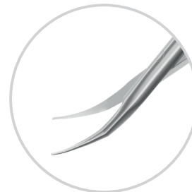
Westcott Tenotomy Scissors Blunt Tips 11-040D