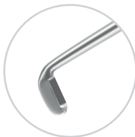
Rosen Phaco Chopper Universal 7-065D