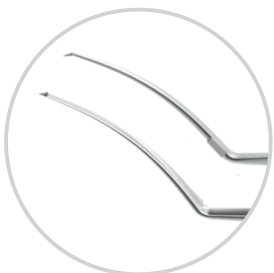
Utrata Capsulorhexis Forceps Cystotome Tips Curved 4-0331D