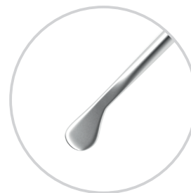
Drysdale Nucleus Manipulator Universal 7-093D