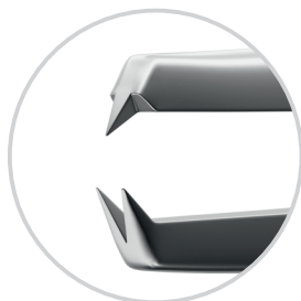
Castroviejo Suturing Forceps 0.12 mm, 1x2 teeth Straight 4-0600D