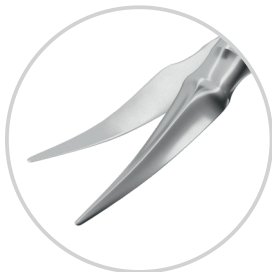
Vannas Capsulotomy Scissors Sharp Tips 11-052D